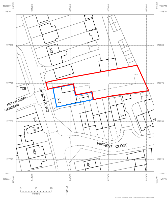
OS MAP 1:1250