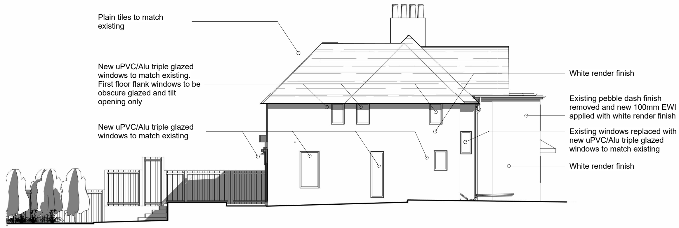
1 Proposed South elevation 1 : 100