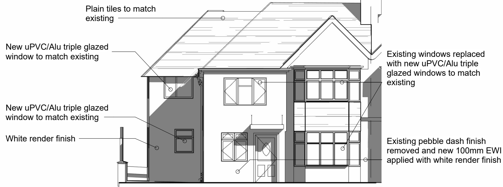
1 Proposed Front elevation 1 : 100