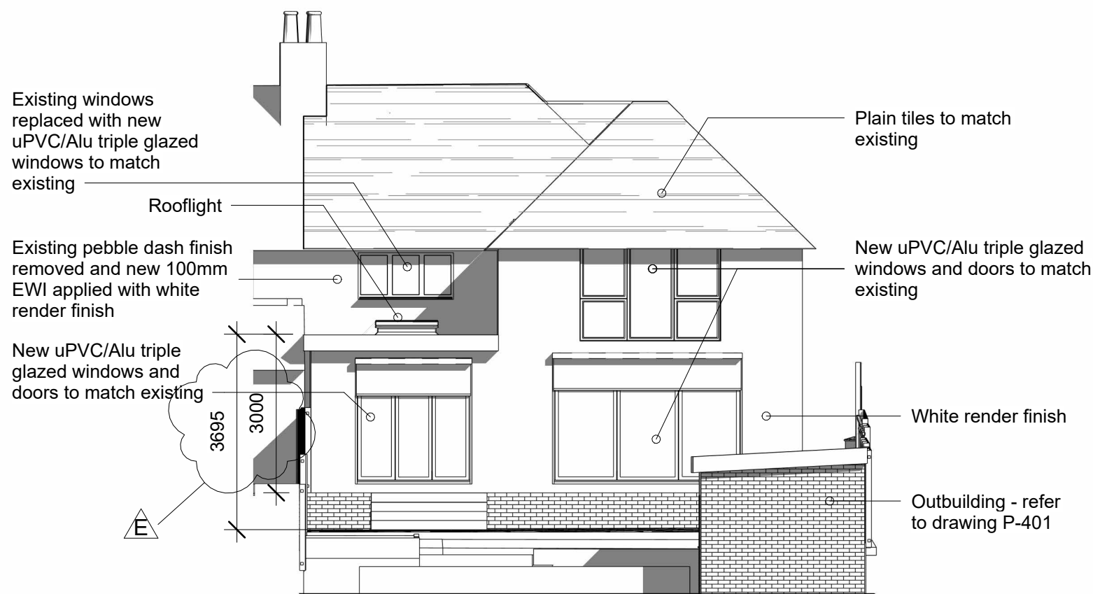
2 Proposed Rear elevation 1 : 100