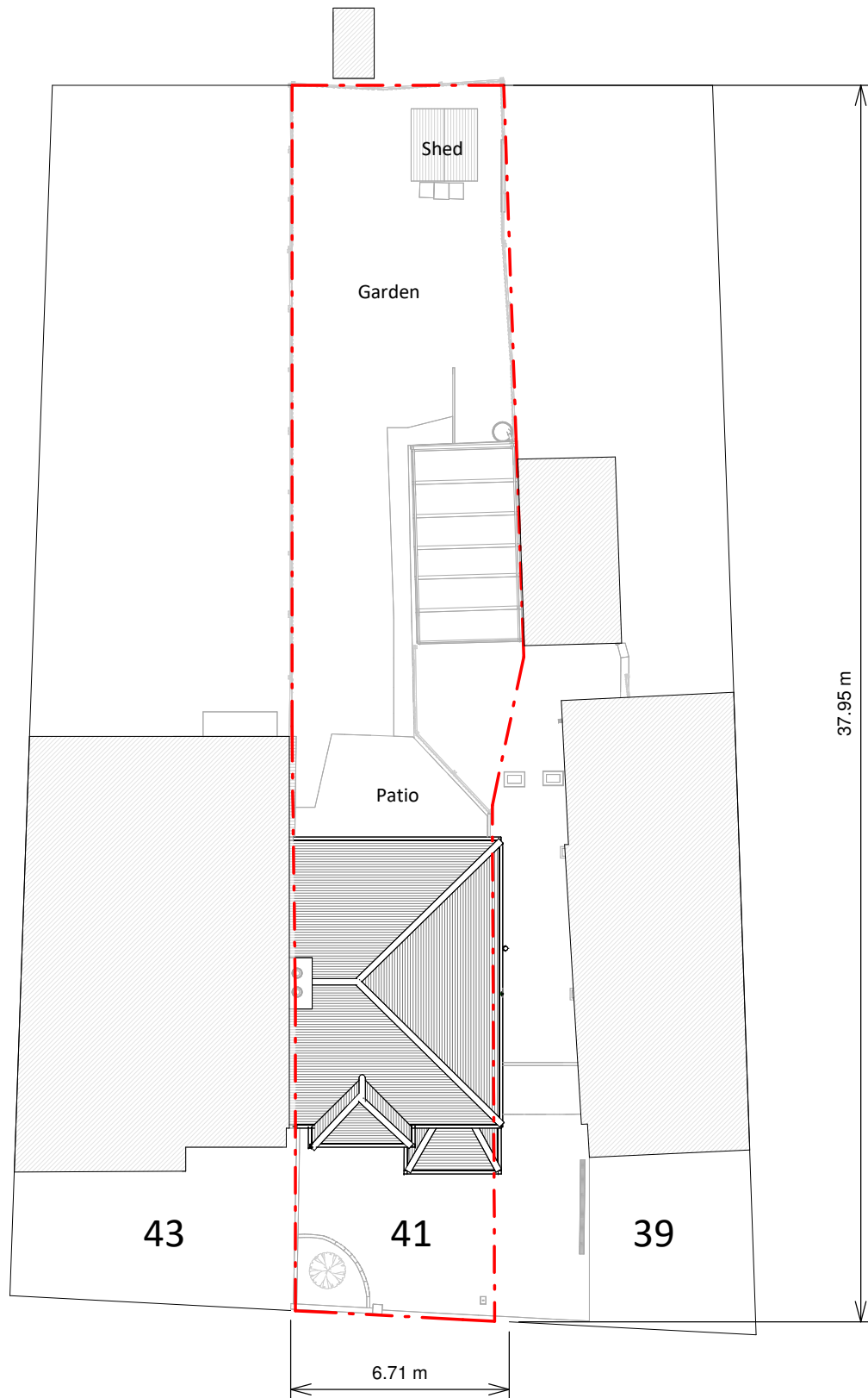
Existing Block Plan