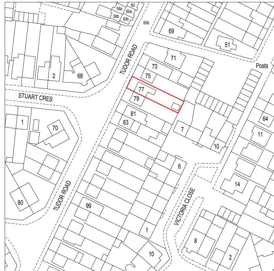
SITE LOCATION PLAN SCALE= 1:1250