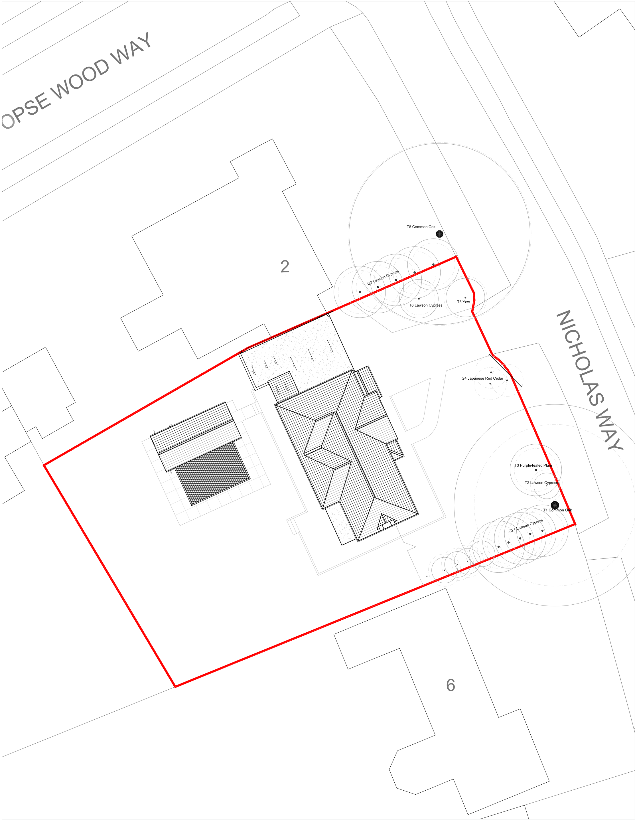
PROPOSED SITE PLAN Scale 1:200