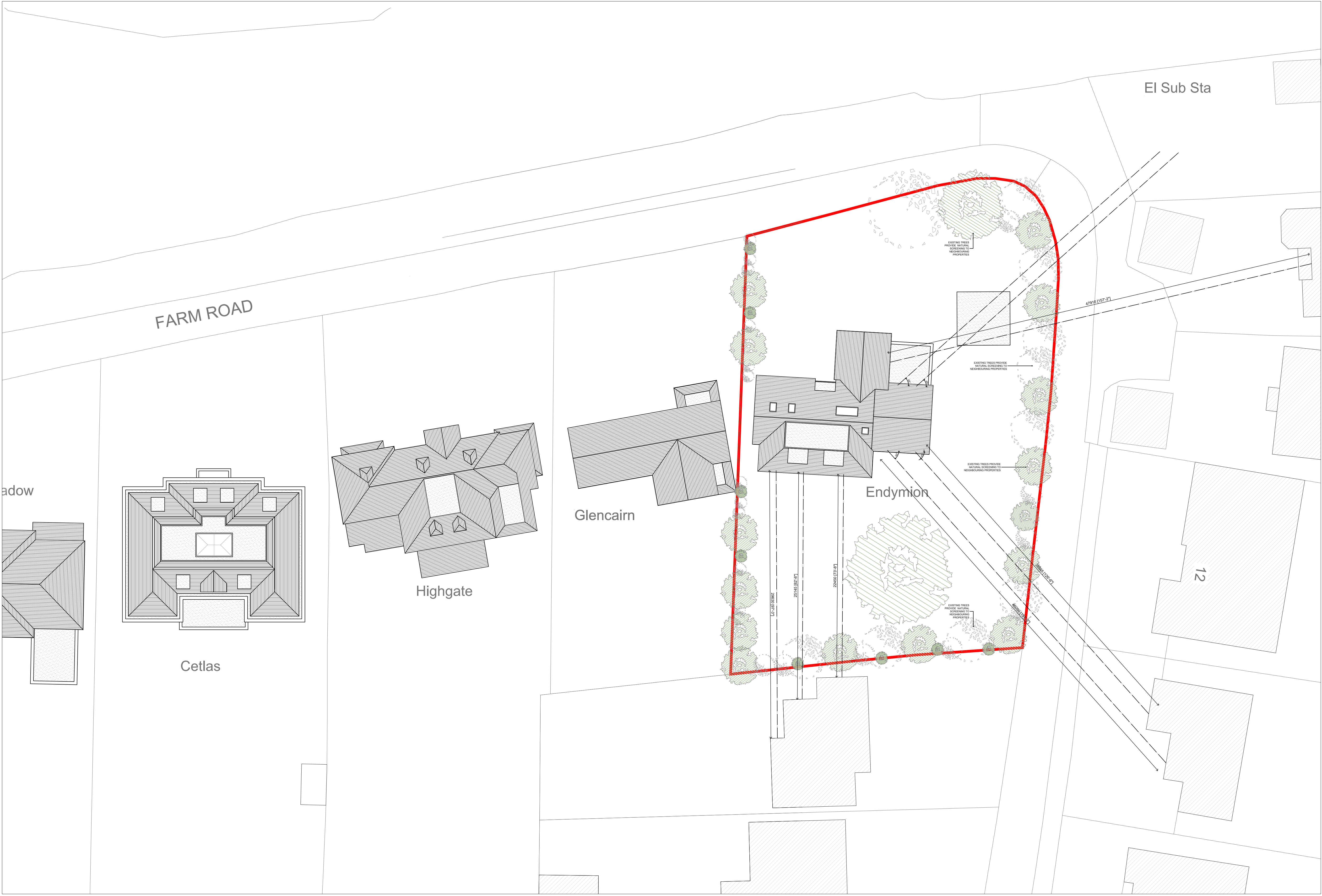
PROPOSED BLOCK PLAN SCALE 1:200