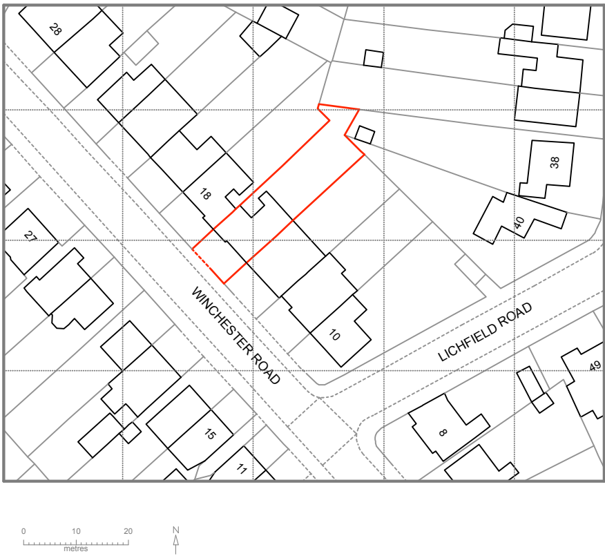
1 Location Map Scale: 1:1000