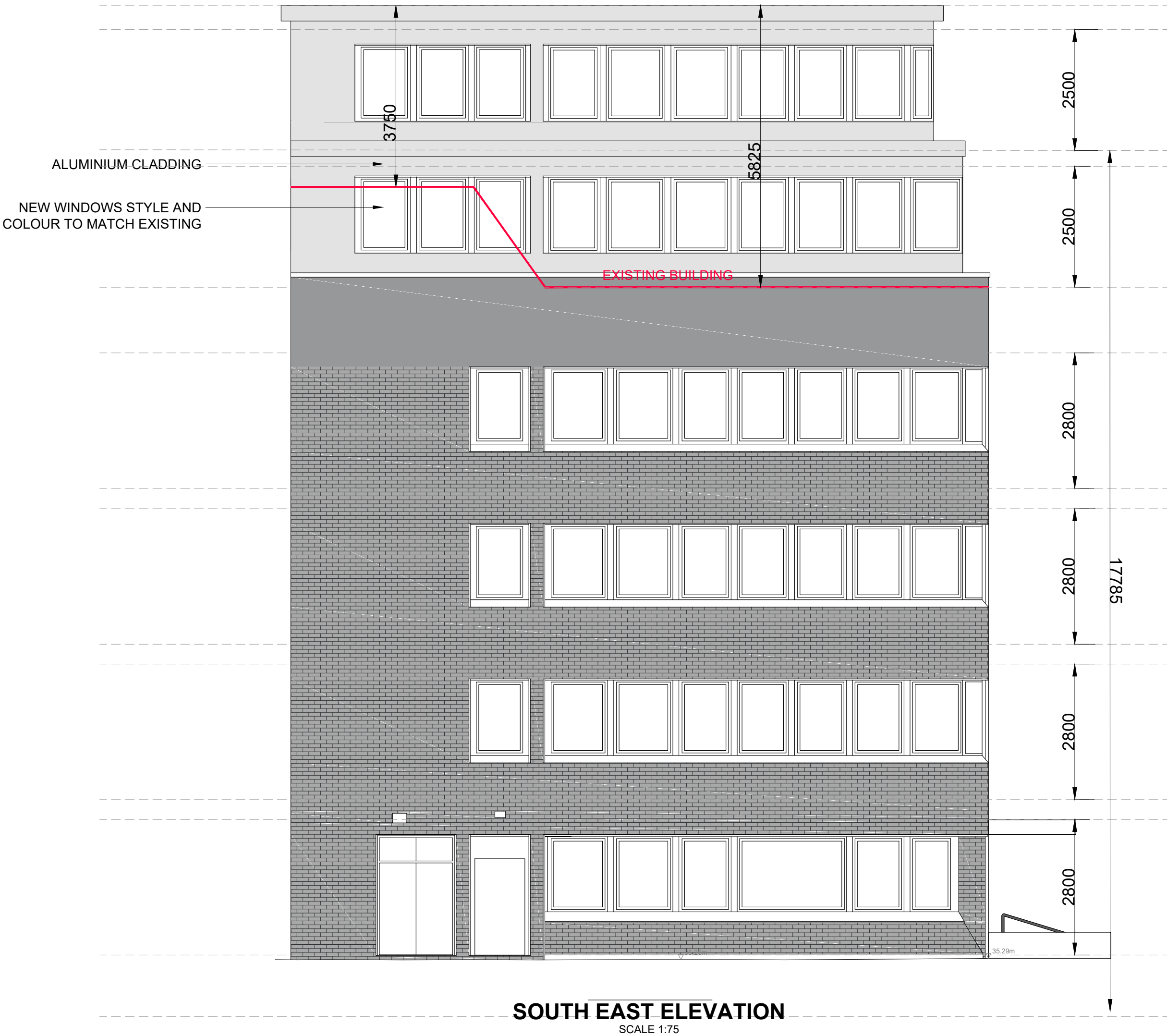
SOUTH EAST ELEVATION SCALE 1:75