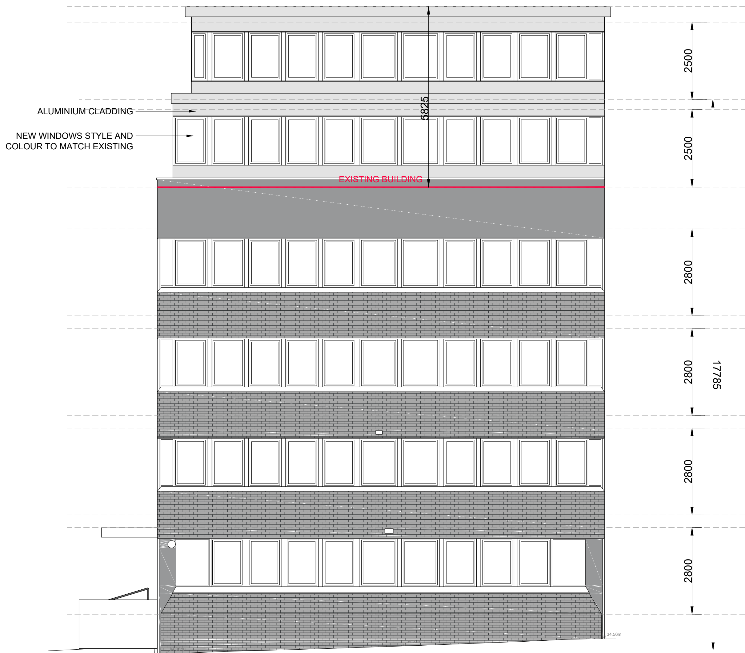
NORTH WEST ELEVATION SCALE 1:75