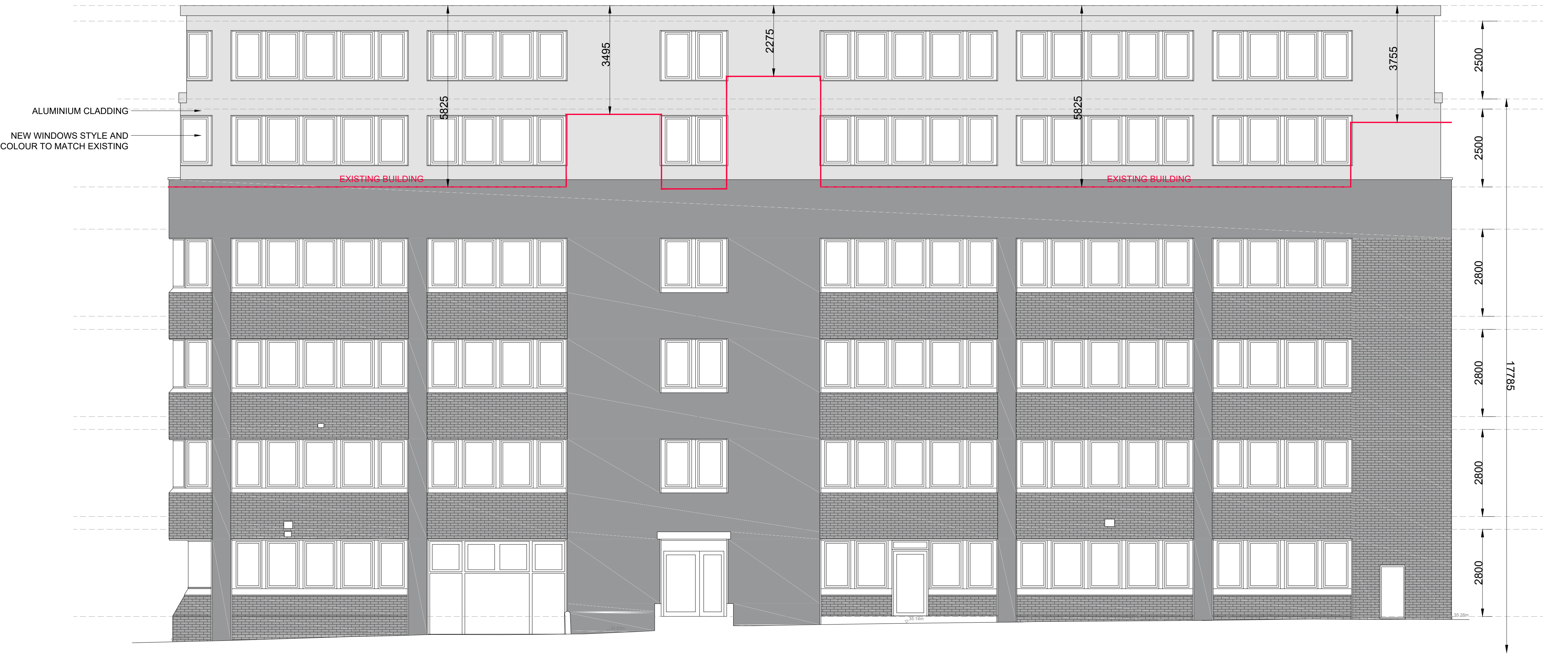
SOUTH WEST ELEVATION SCALE 1:75