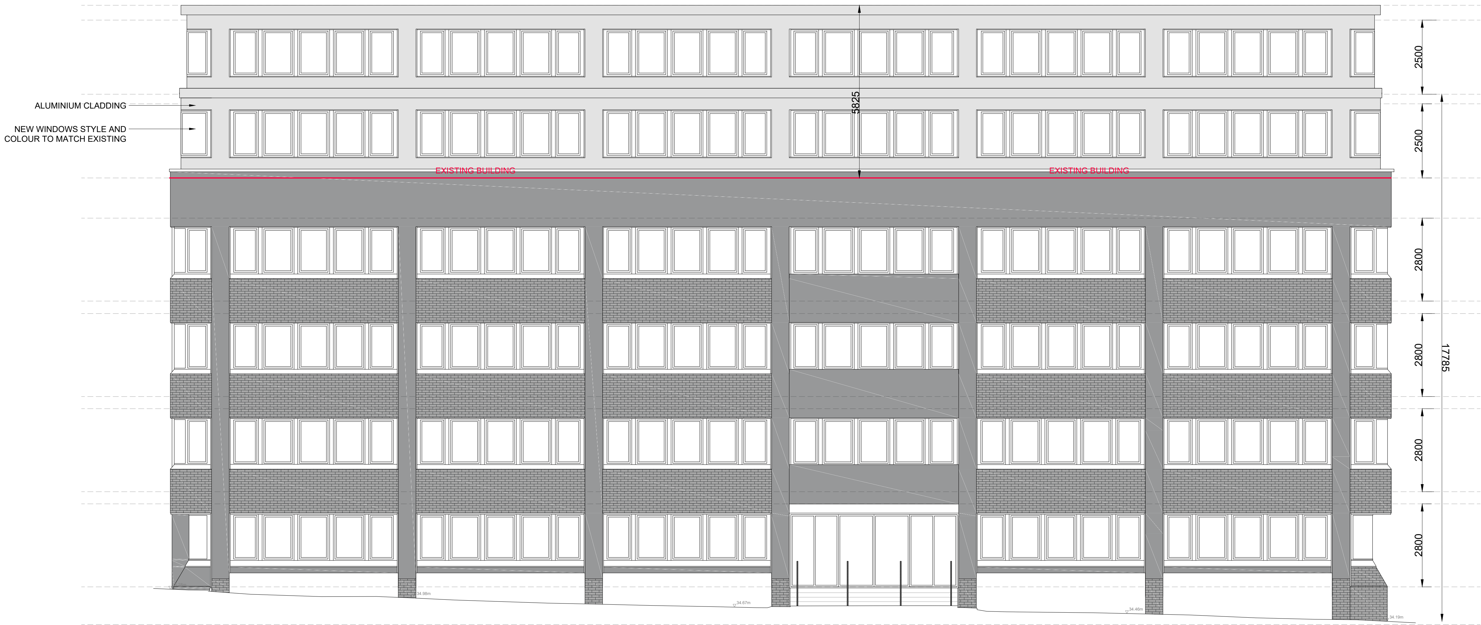
NORTH EAST ELEVATION SCALE 1:75