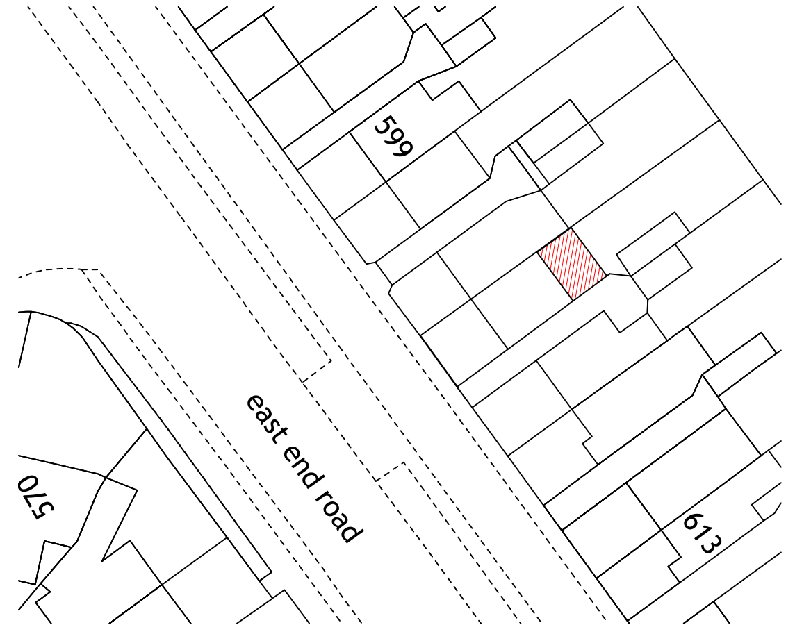
block plan scale 1:500