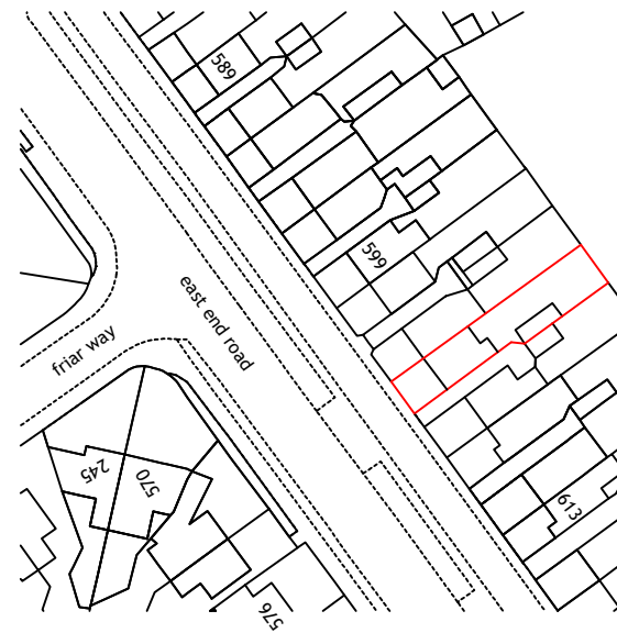
location plan scale 1:1250