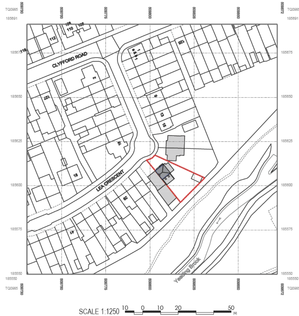
01 Site Location Plan 1:1250