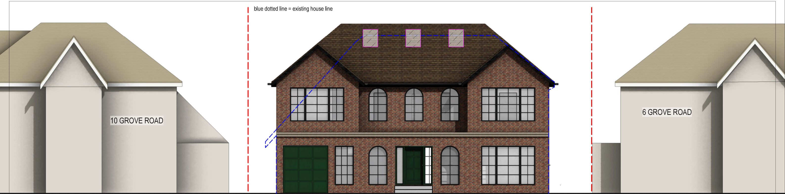
01 01 PROP ELEV FRONT Scale: 1:100