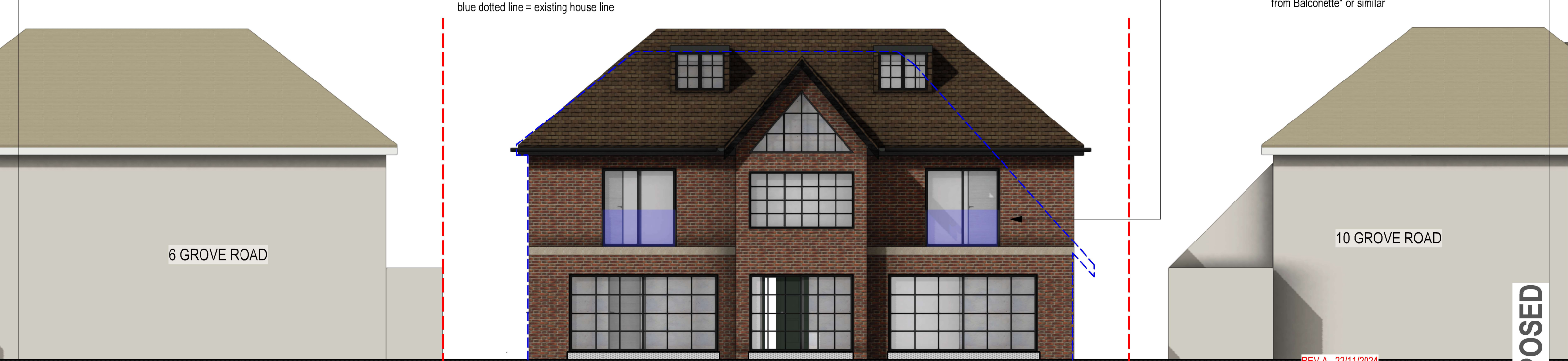
02 02 PROP REAR ELEV Scale: 1:100

Balcony glass to be 21.5mm laminated toughened Railing to be min 1.1 meter high from SILL Strength - handrail/glass pressure must be able to take 1.5kN/m and to meet BS 6180:2011 and be tested for impact loading in accordance with BS 6206 and BS EN 12600. "Frameless Juliette system, Code: FBAL 100 R from Balconette" or similar