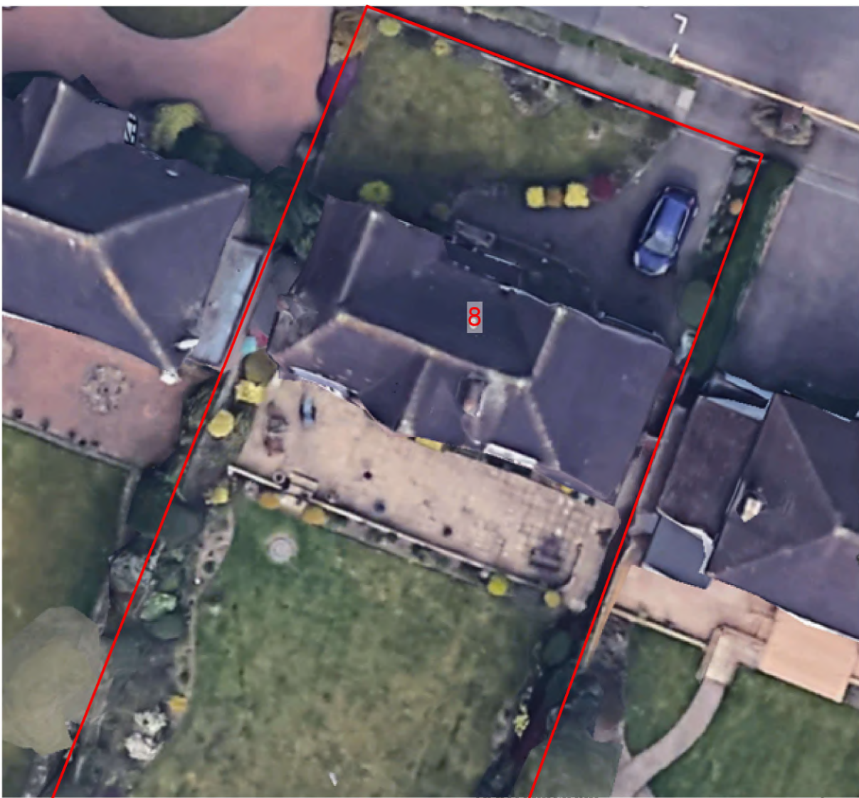
AERIAL VIEW Site shown in red