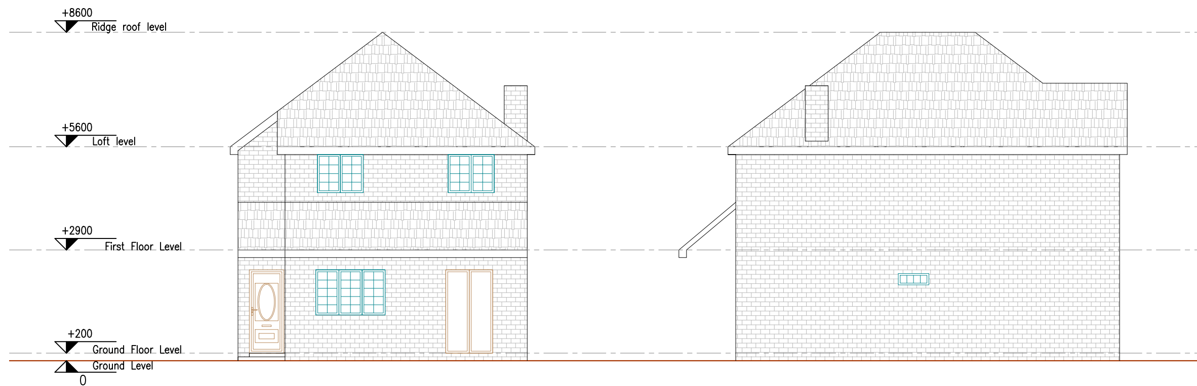
6 EXISTING REAR ELEVATION SCALE 1:100 @ A3