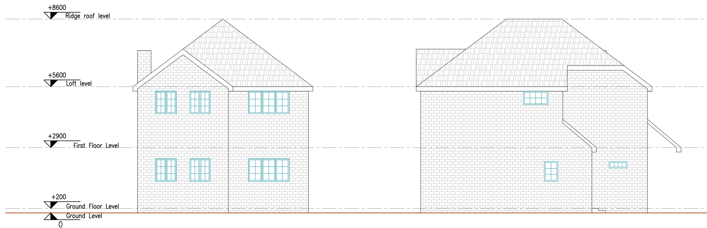
4 EXISTING FRONT ELEVATION SCALE 1:100 @ A3