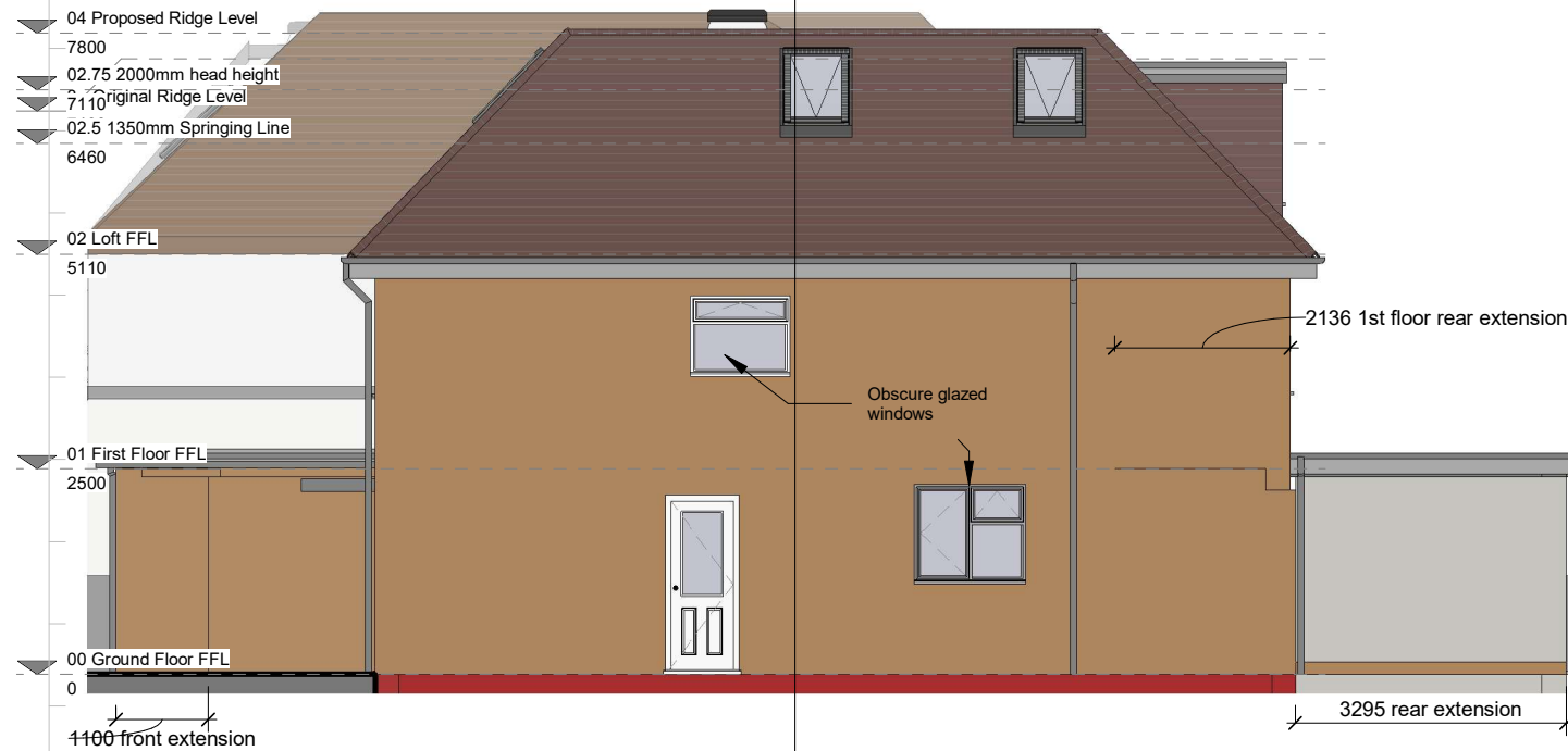
Proposed RHS Elevation