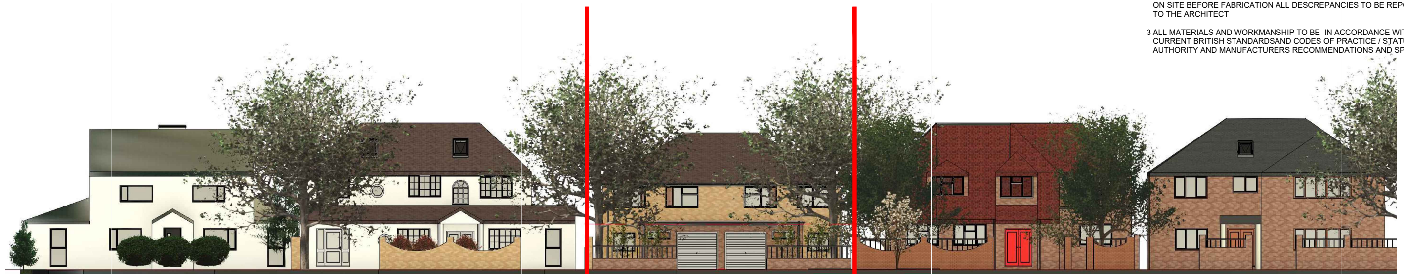
231 Existing Streetscene

3 ALL MATERIALS AND WORKMANSHIP TO BE IN ACCORDANCE WITH ALL CURRENT BRITISH STANDARDS AND CODES OF PRACTICE / STATUTORY AUTHORITY AND MANUFACTURERS RECOMMENDATIONS AND SPECIFICATIONS