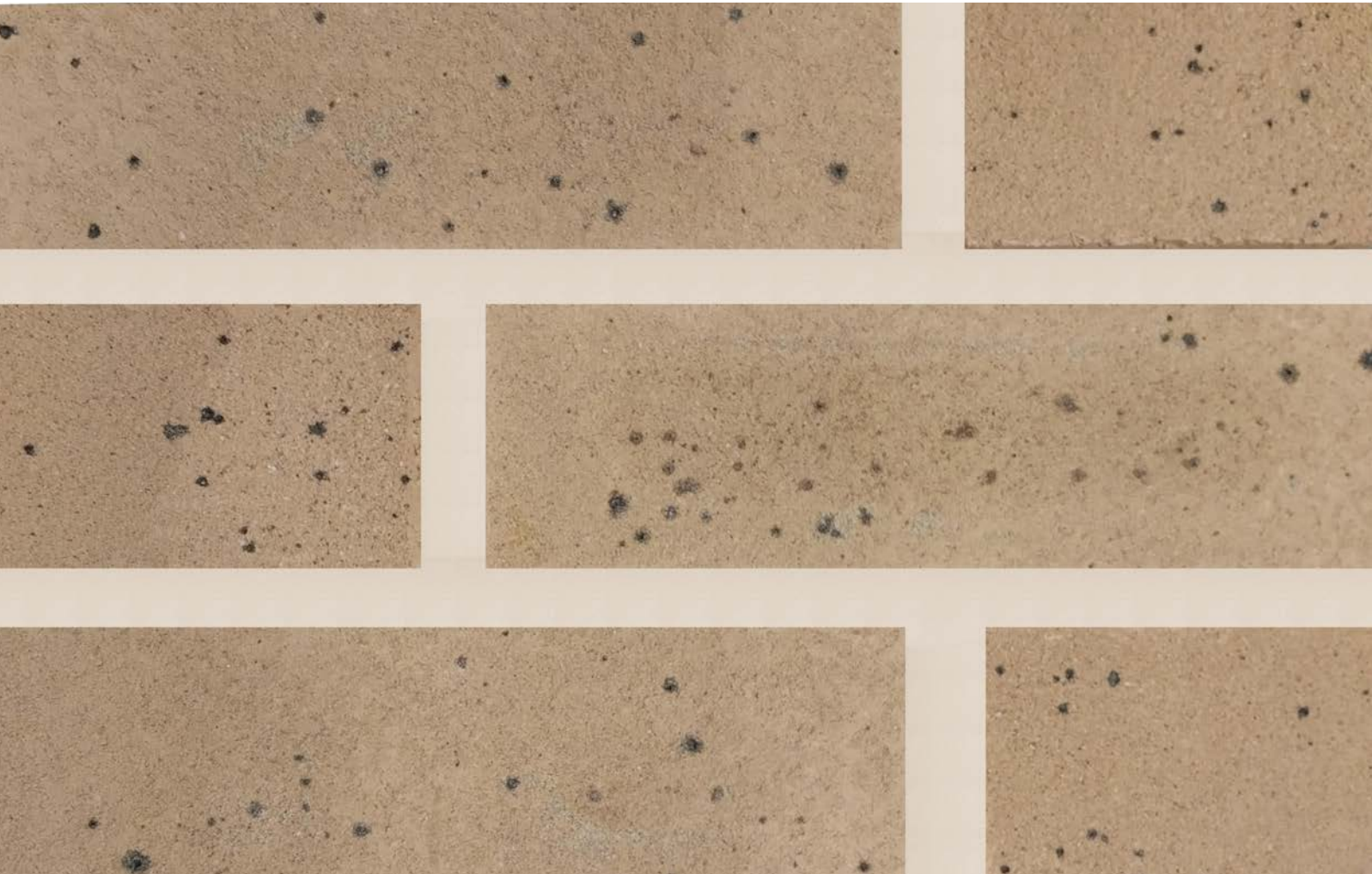
(2) (3) Buff brick - Sandalwood Yellow Multi Mortar- Braintree Light or similar