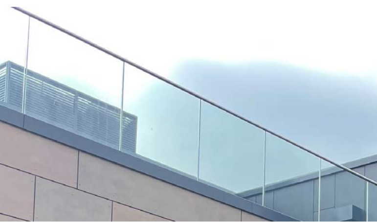
(14) Glass balustrade panels to roof terraces - satin polish stainless steel top rail; laminated glass infills, opaque interlayer to glass infills around Plant Terrace