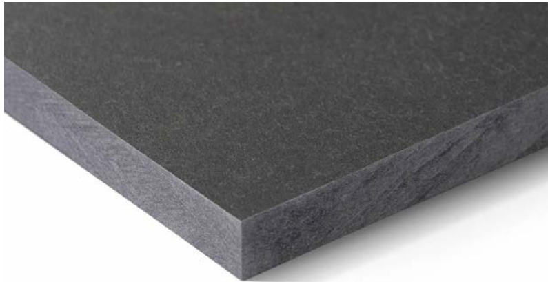
(19) Fibre cement panel to inner face of parapet - Anthracite 7020