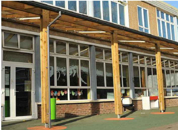
(13) (11) Drop-off entrance canopy - glulam timber frame with light grey single ply roof membrane on timber deck