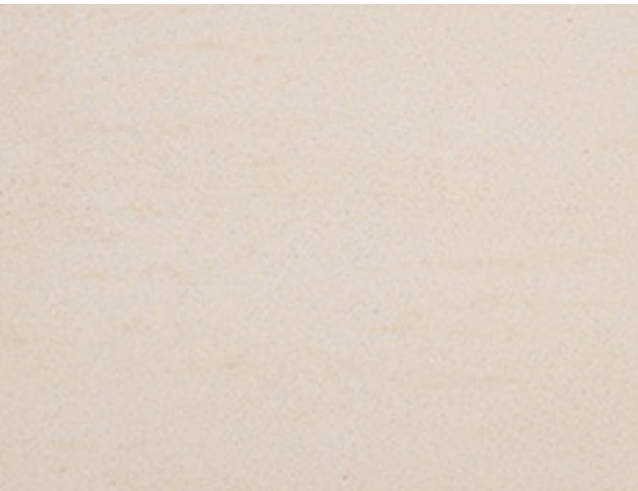
(2) (3) Mortar- Braintree Light or similar