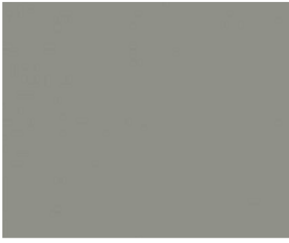
(1) (5) (6) (7) (8) (9) (15) PPC aluminium - RAL 7030