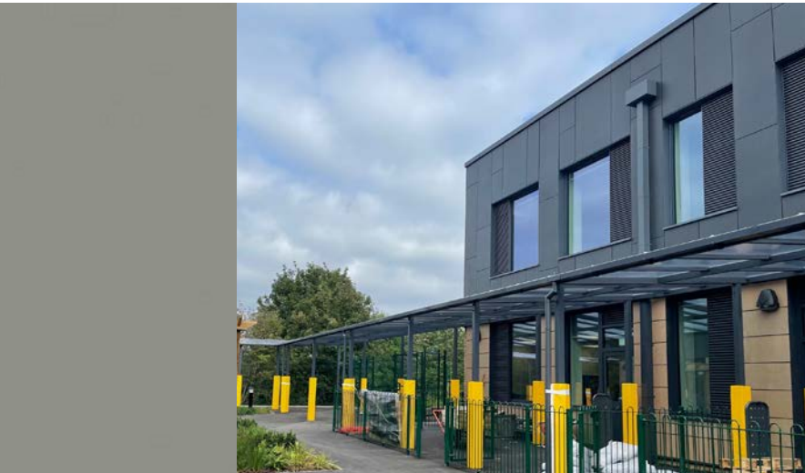
(15) PPC aluminium teaching canopy - RAL 7030