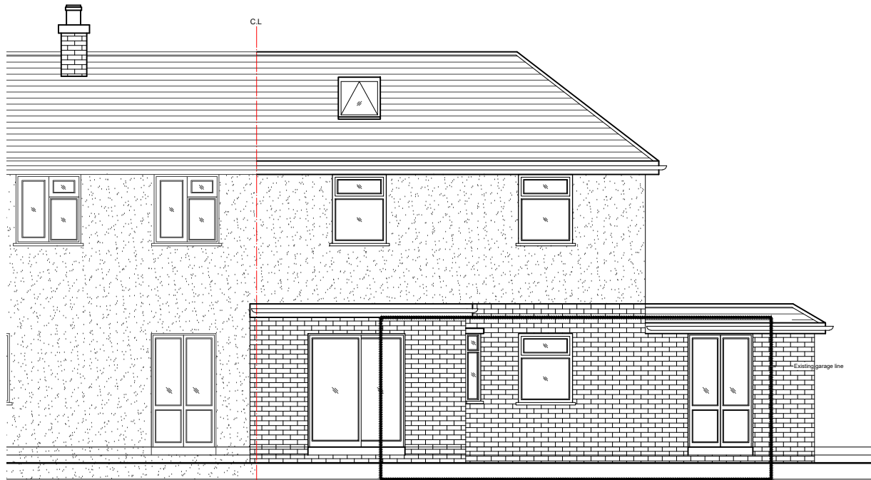
03 - REAR ELEVATION