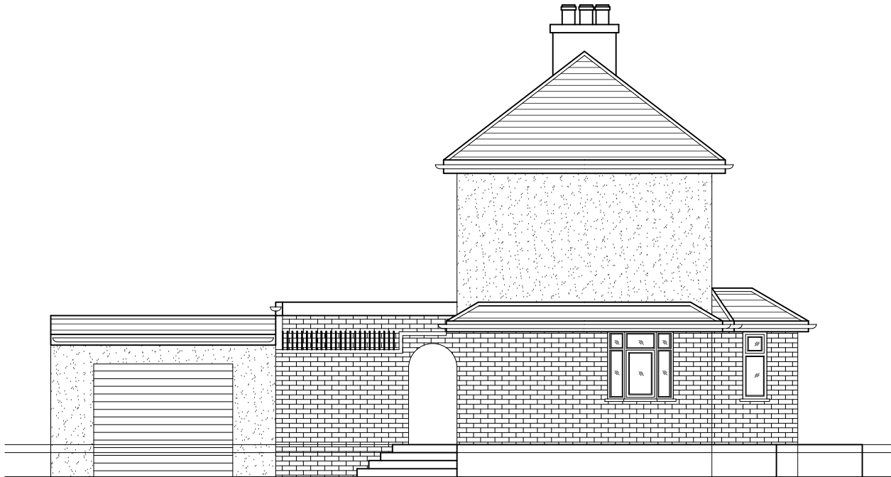
02 - LEFT SIDE ELEVATION