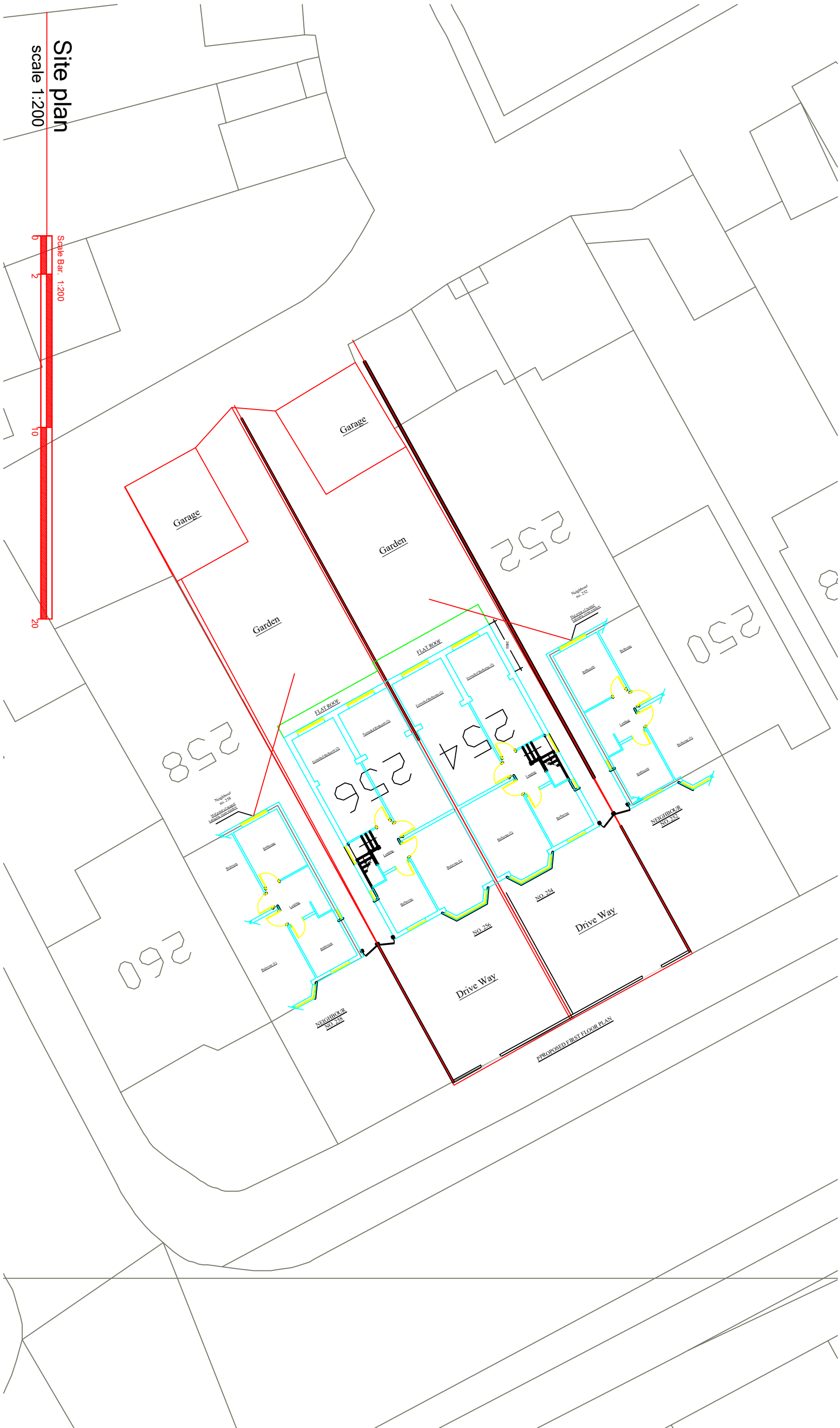
Site plan scale 1:200