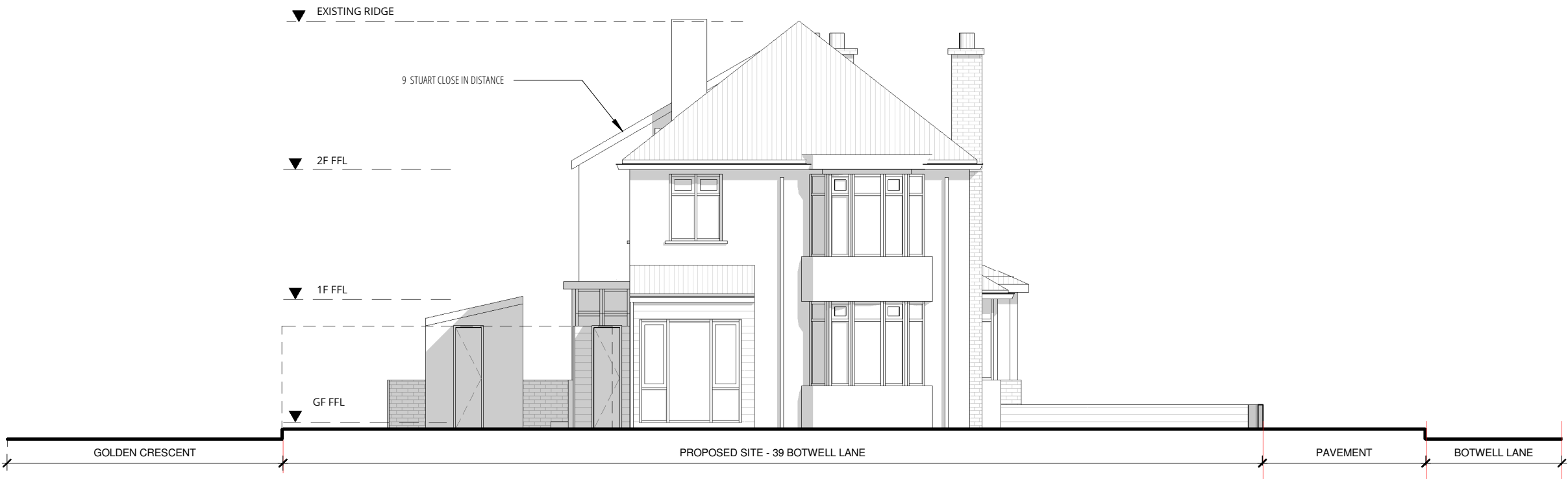
02 EXISTING FRONT / EAST ELEVATION 1:100 @ A3