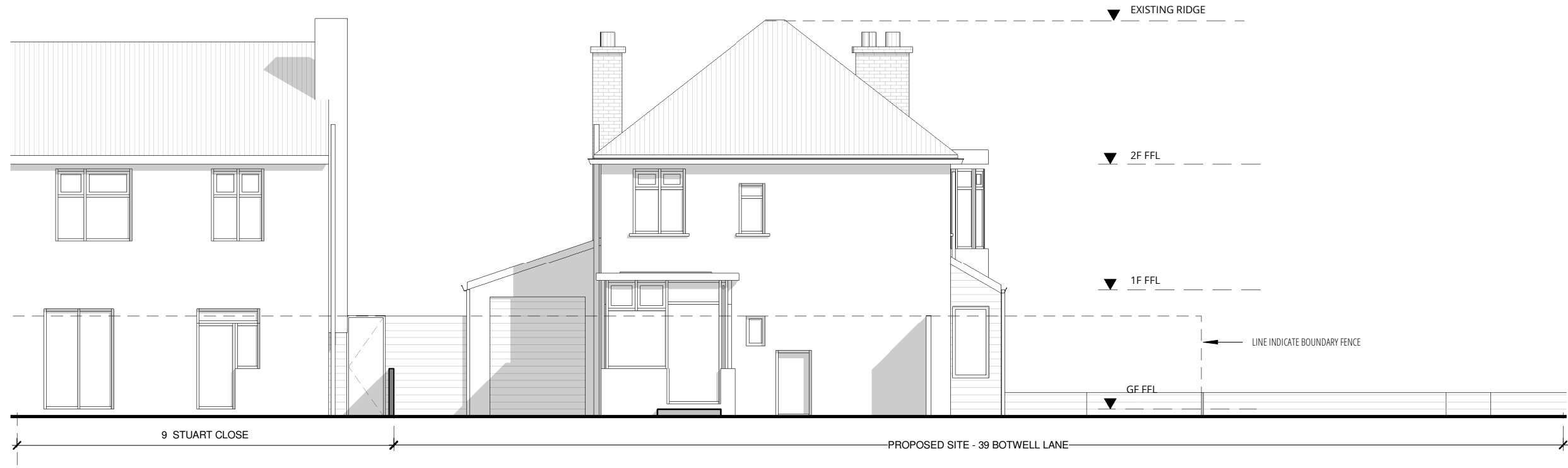
01 EXISTING SIDE / SOUTH ELEVATION 1:100 @ A3