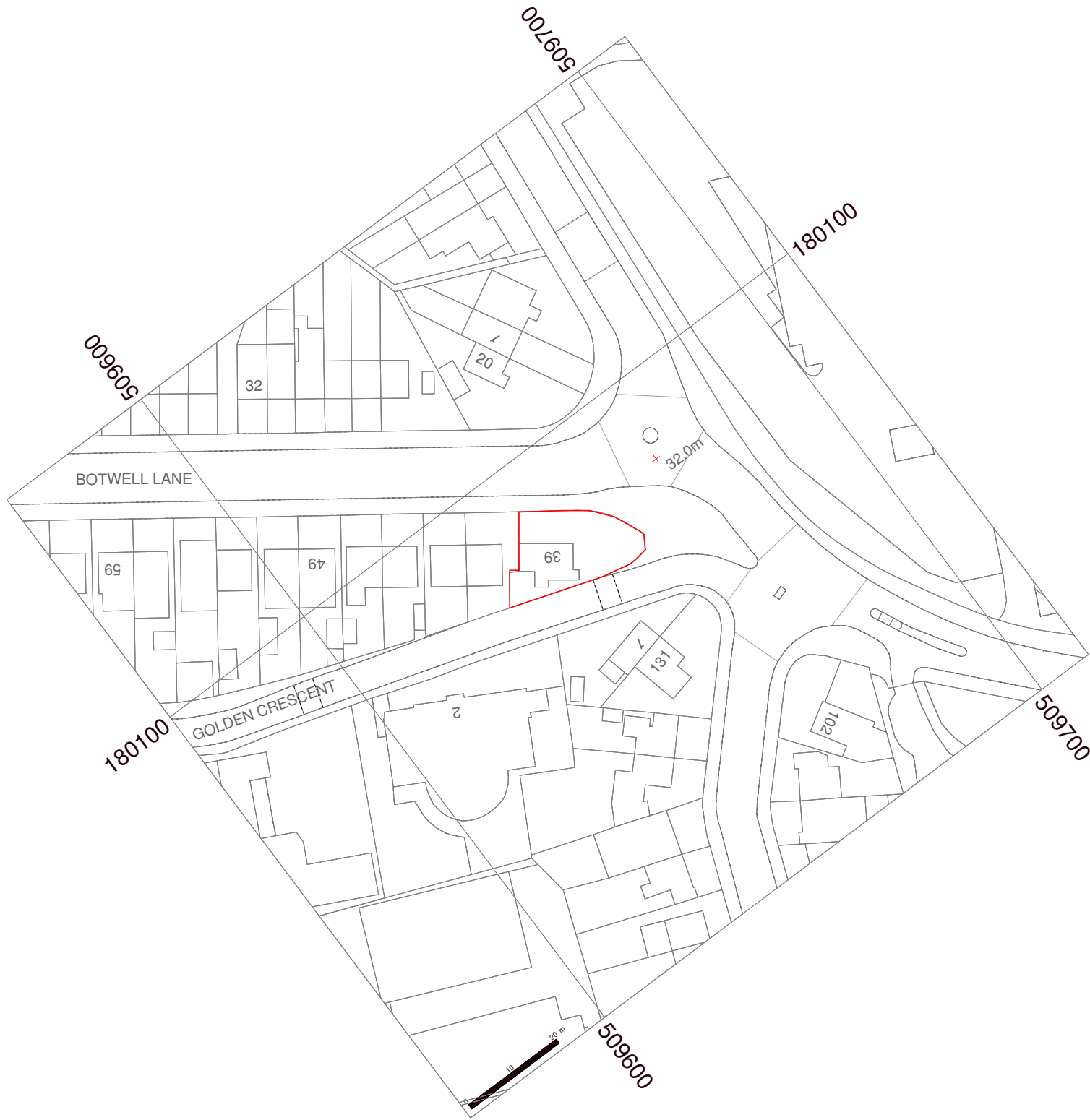
01 LOCATION PLAN 1:1000 @ A3