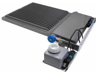
Clearflood Large CityTouch- DPP.jpg