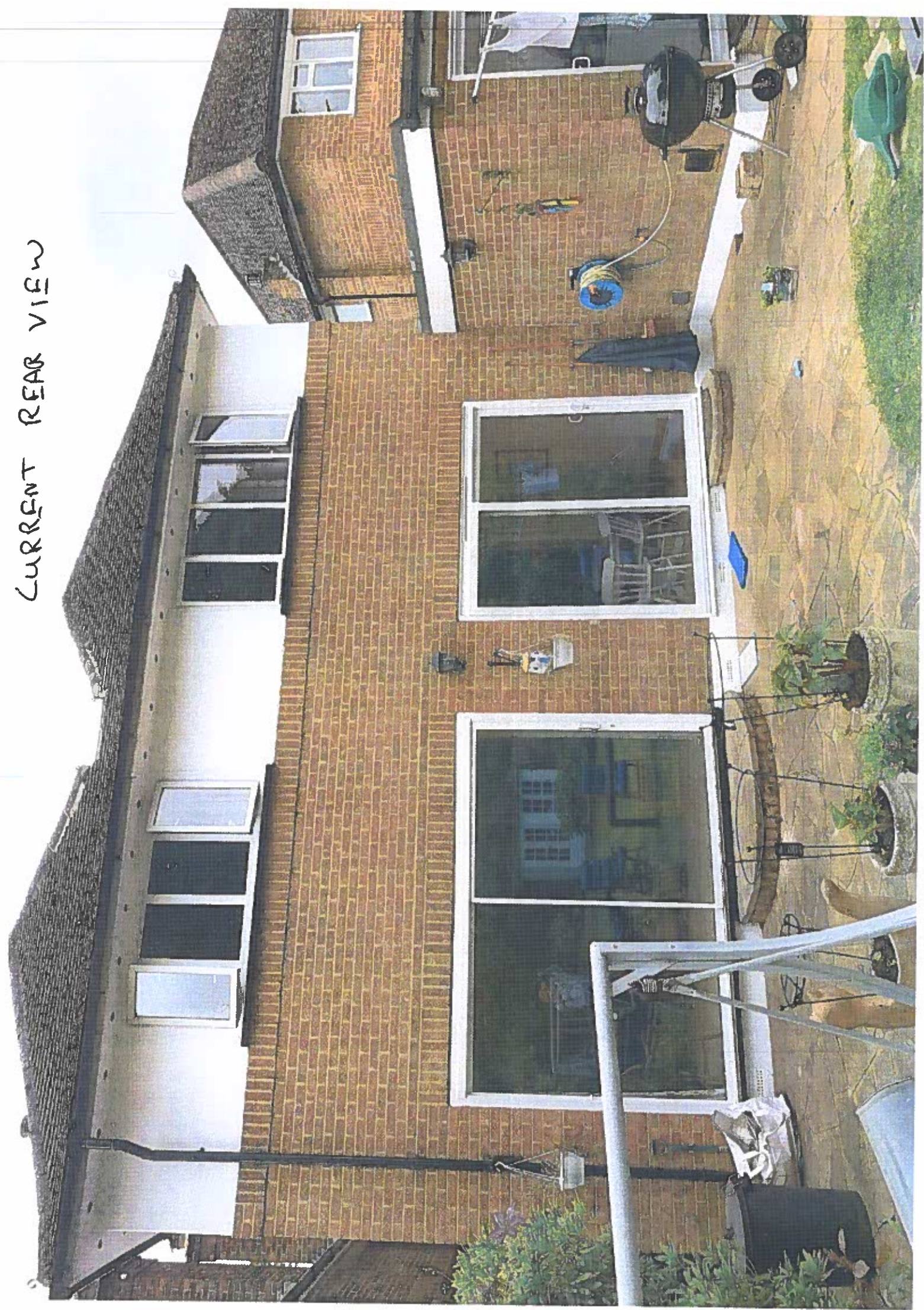
CURRENT REAR VIEW