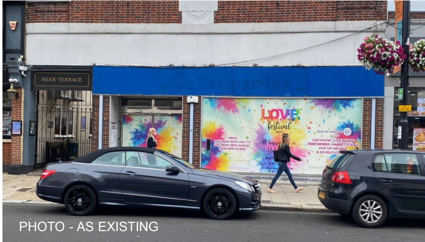
PHOTO - AS EXISTING

01 Copyright of this drawing is reserved by o1 creative and issued on condition that it is not copied, reproduced or disclosed either wholly or in part without the written permission of o1 creative 69 OLD ST LONDON EC1V 9HX TEL : 0207 400 1178