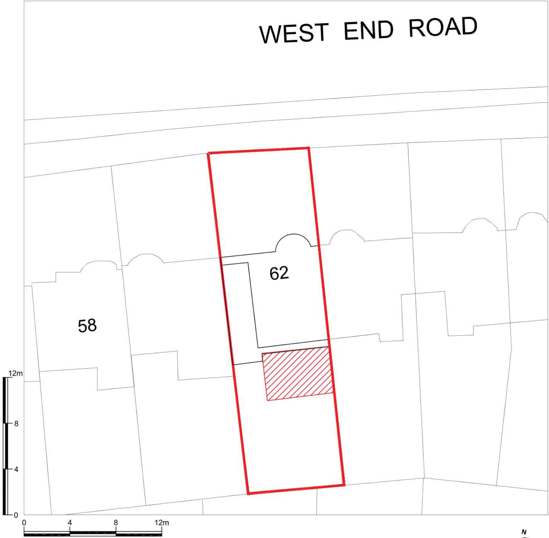
Block plan 1:200