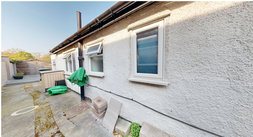
4 - Side access