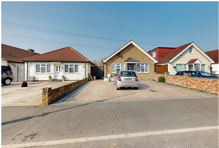
3 - 23,25 & 27 Nicholls Avenue