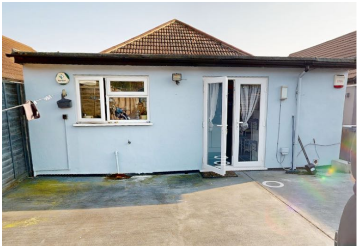
5 - Rear Elevation