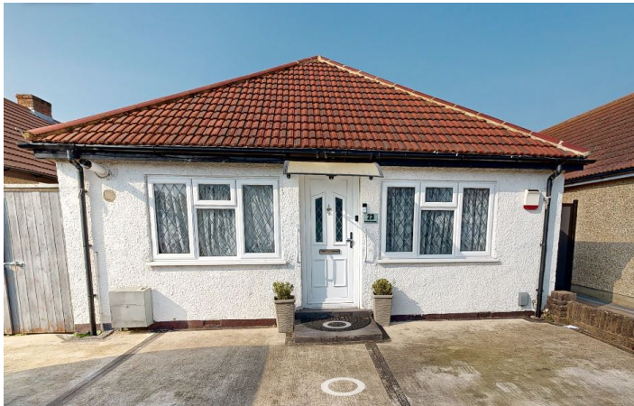
1 - House Entrance