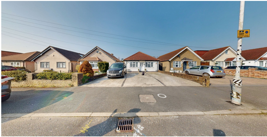
2 - Overview of Nicholls Avenue