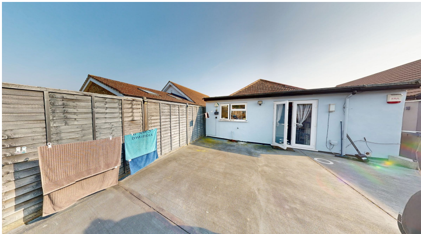
6 - Rear Elevation