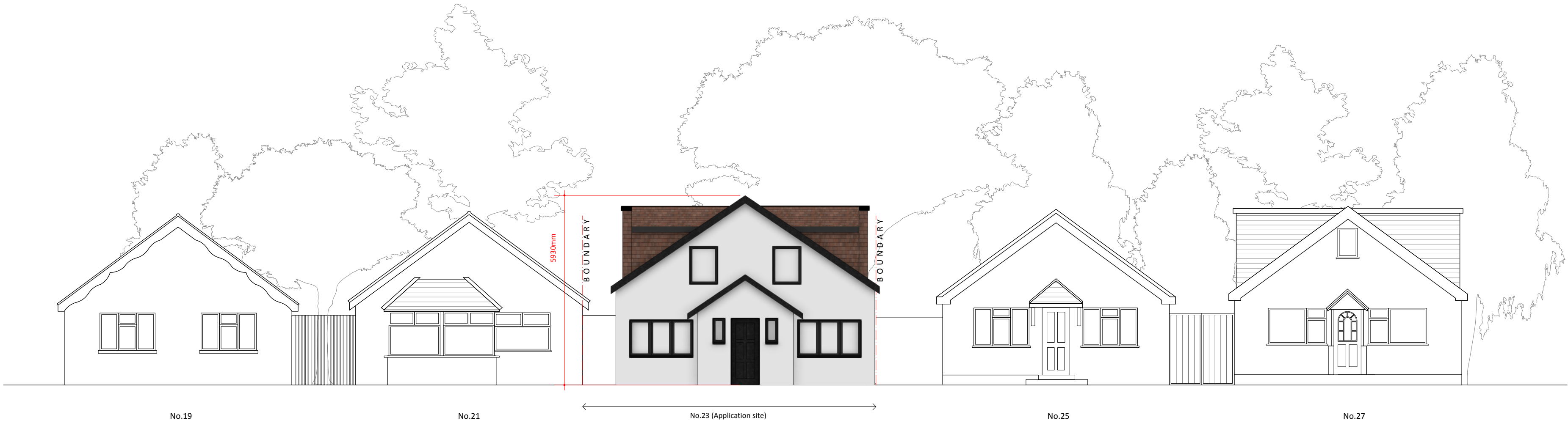
2 ELEVATION B