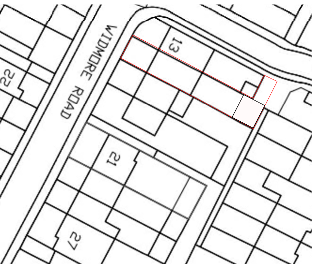
BLOCK PLAN SCALE 1:500 @ A3