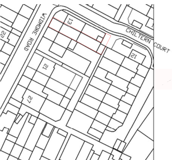
SITE LOCATION PLAN SCALE 1:1250 @ A3