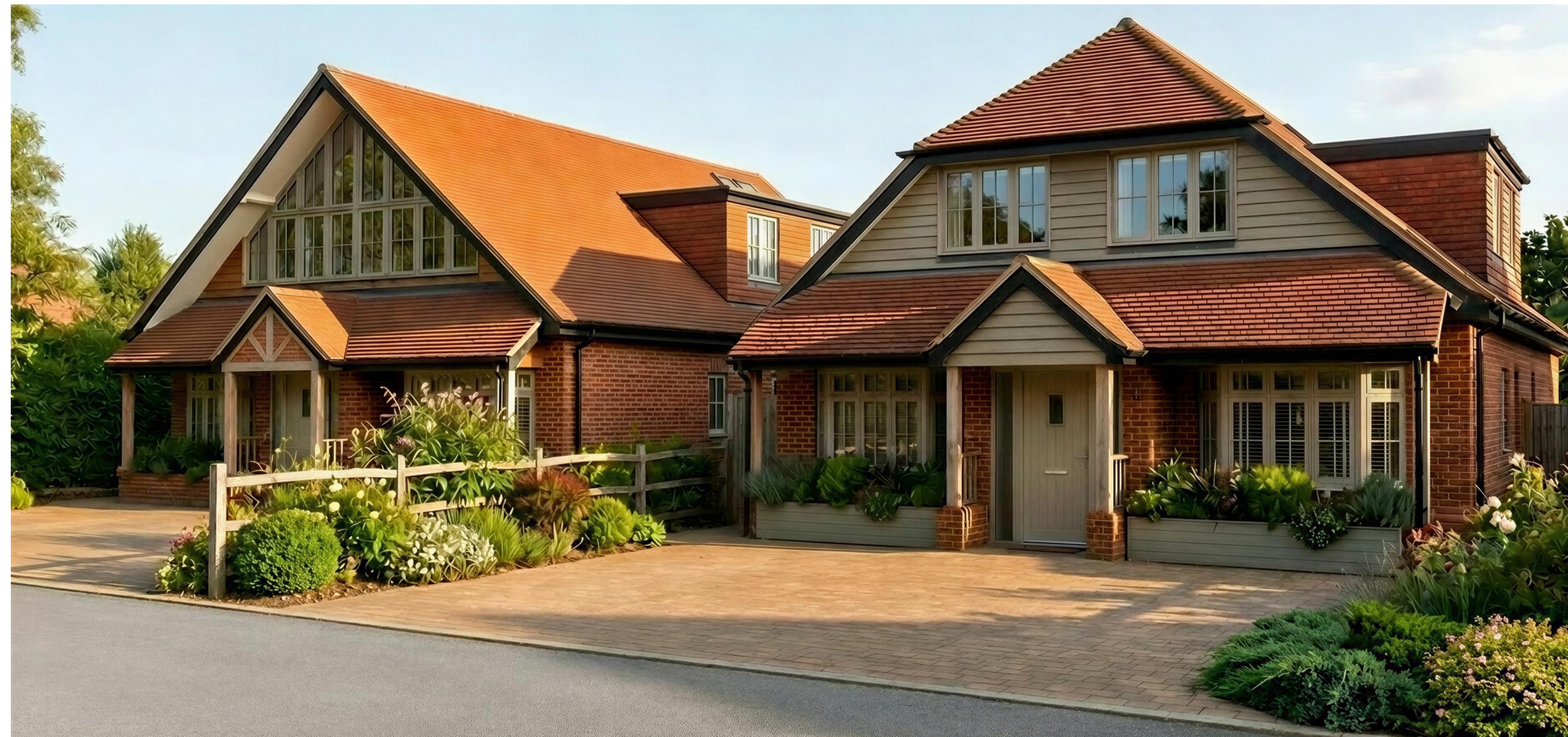
02 Sketch Visual NTS

In addition to the hazards normally associated with the types of work proposed, it is assumed that all works on this drawing will be carried out by a competent contractor working, where appropriate, to an appropriate method statement.