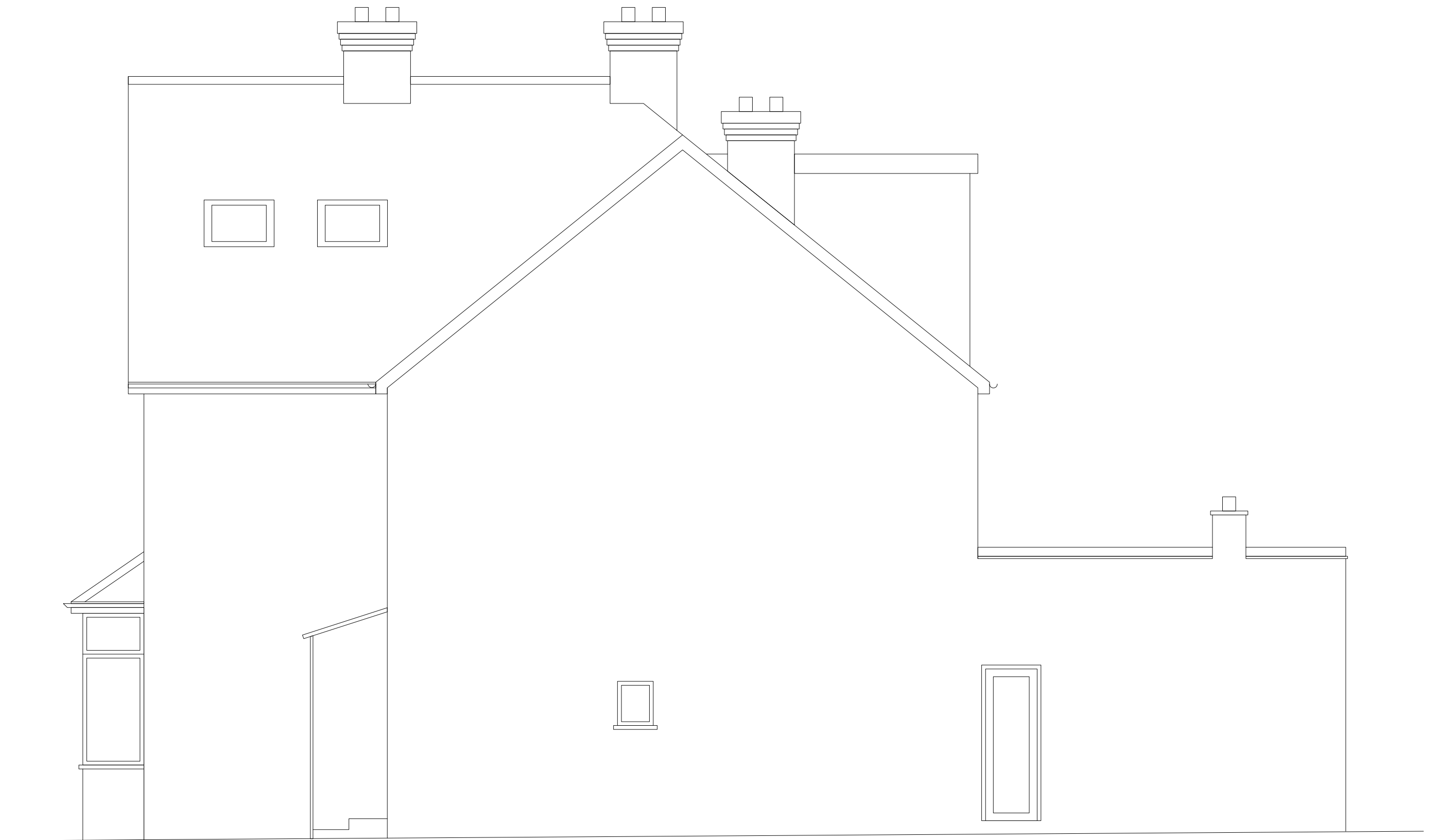
1 Existing Side Elevation Scale: 1:50