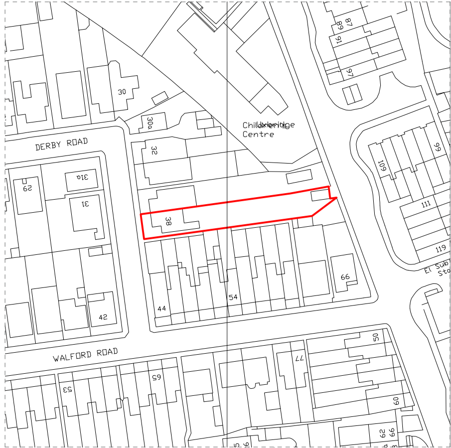
2 Location Plan Scale: 1:1250