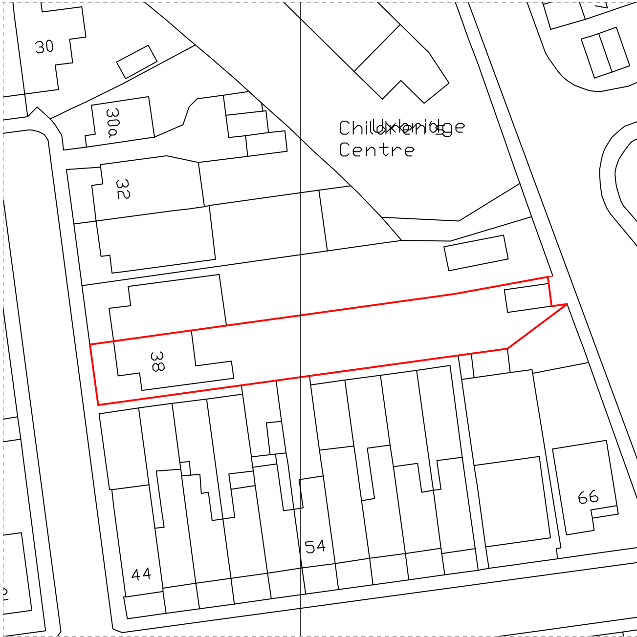
1 Block Plan Scale: 1:500