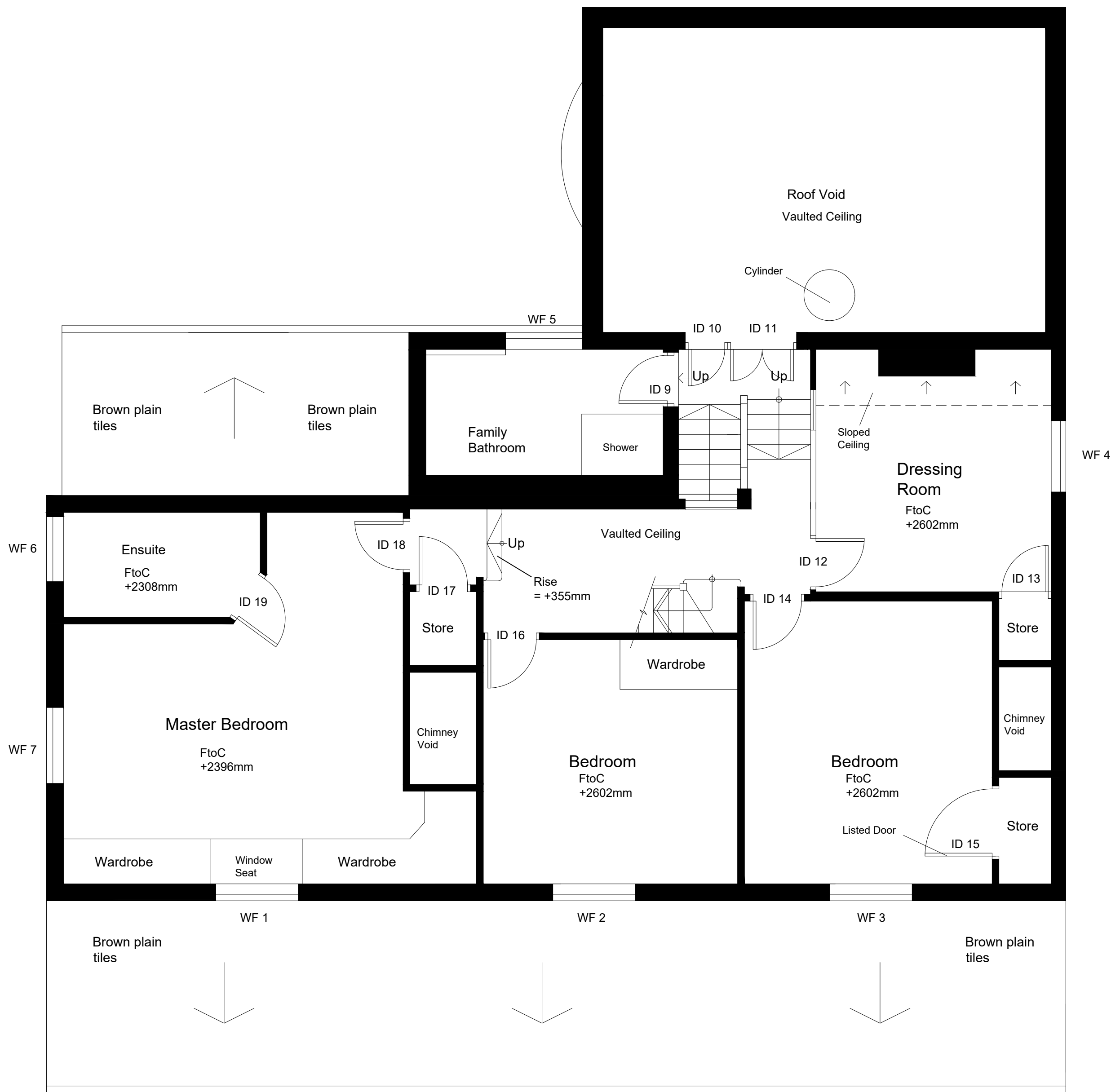
Existing First Floor Plan Scale 1:50 @ A1

DRAWING CAN BE SCALED FOR PLANNING SUBMISSION PURPOSES ONLY BUT IF IN ANY DOUBT ABOUT A DIMENSION OR ANY OF THE DRAWN INFORMATION PLEASE ASK CDRB ARCHITECTS LTD IMMEDIATELY.