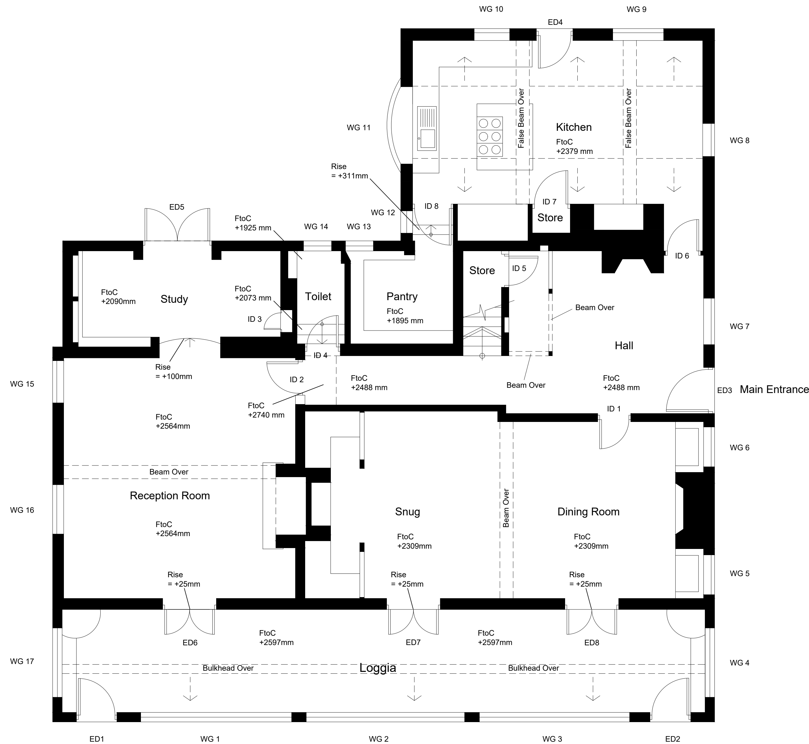
Existing Ground Floor Plan Scale 1:50 @ A1

GENERAL NOTES DRAWING CAN BE SCALED FOR PLANNING SUBMISSION PURPOSES ONLY BUT IF IN ANY DOUBT ABOUT A DIMENSION OR ANY OF THE DRAWN INFORMATION PLEASE ASK CDRB ARCHITECTS LTD.