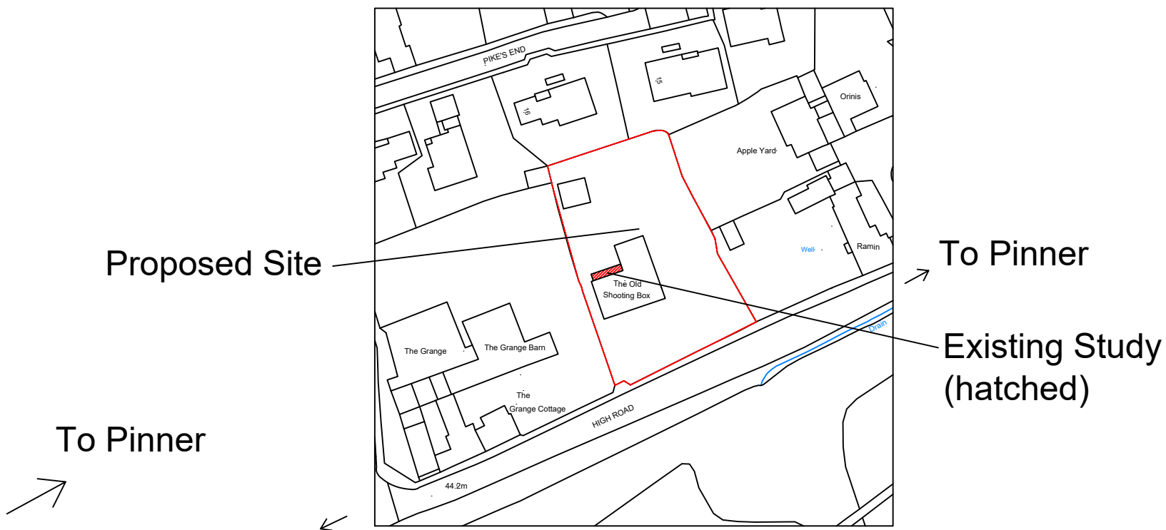
Location Plan Scale 1:1250 @ A1