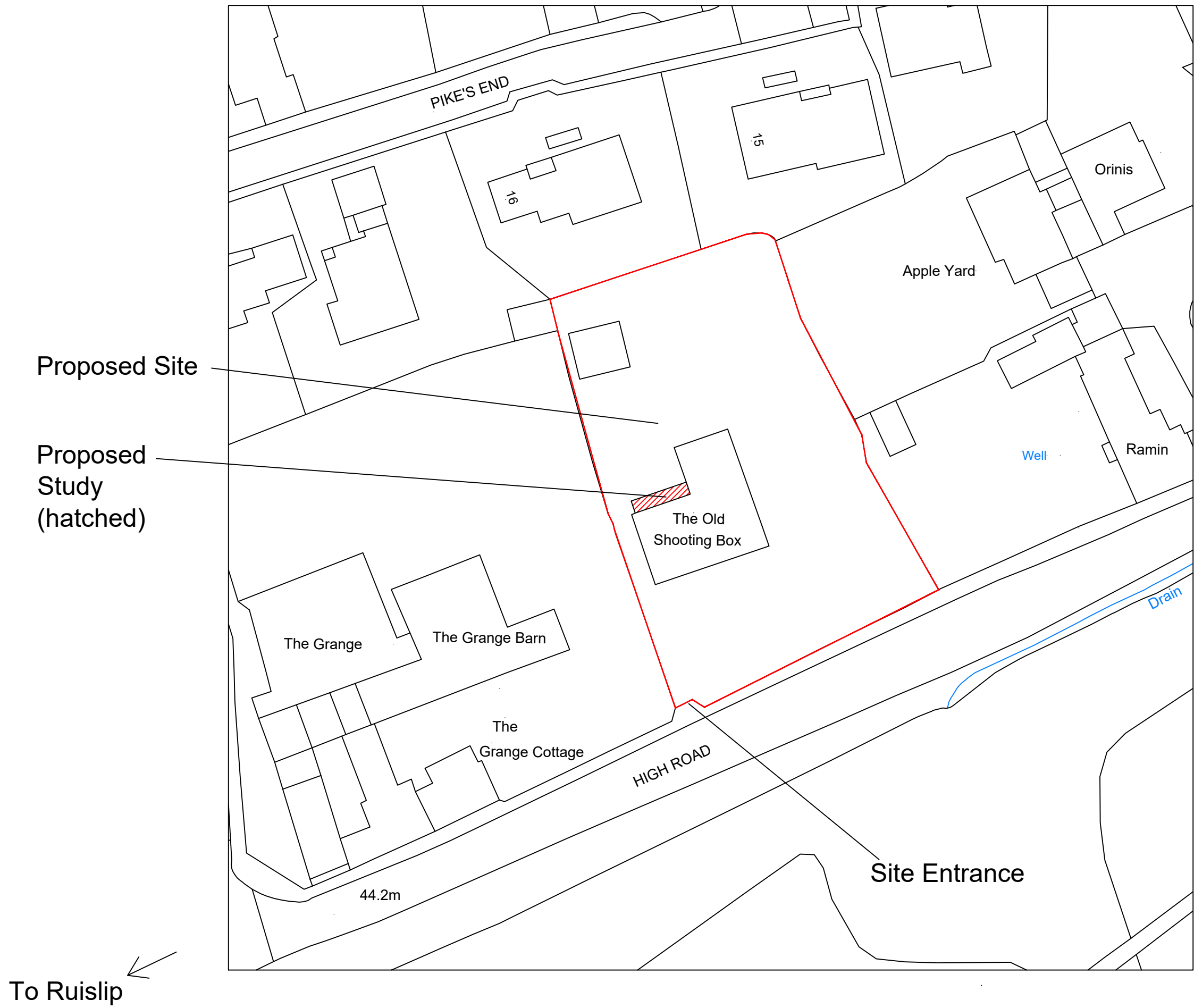
Block Plan Scale 1:500 @ A1

DRAWING CAN BE SCALED FOR PLANNING PURPOSES ONLY BUT IF IN ANY DOUBT ABOUT A DIMENSION OR ANY OF THE DRAWN INFORMATION PLEASE ASK CDRB ARCHITECTS LTD IMMEDIATELY.