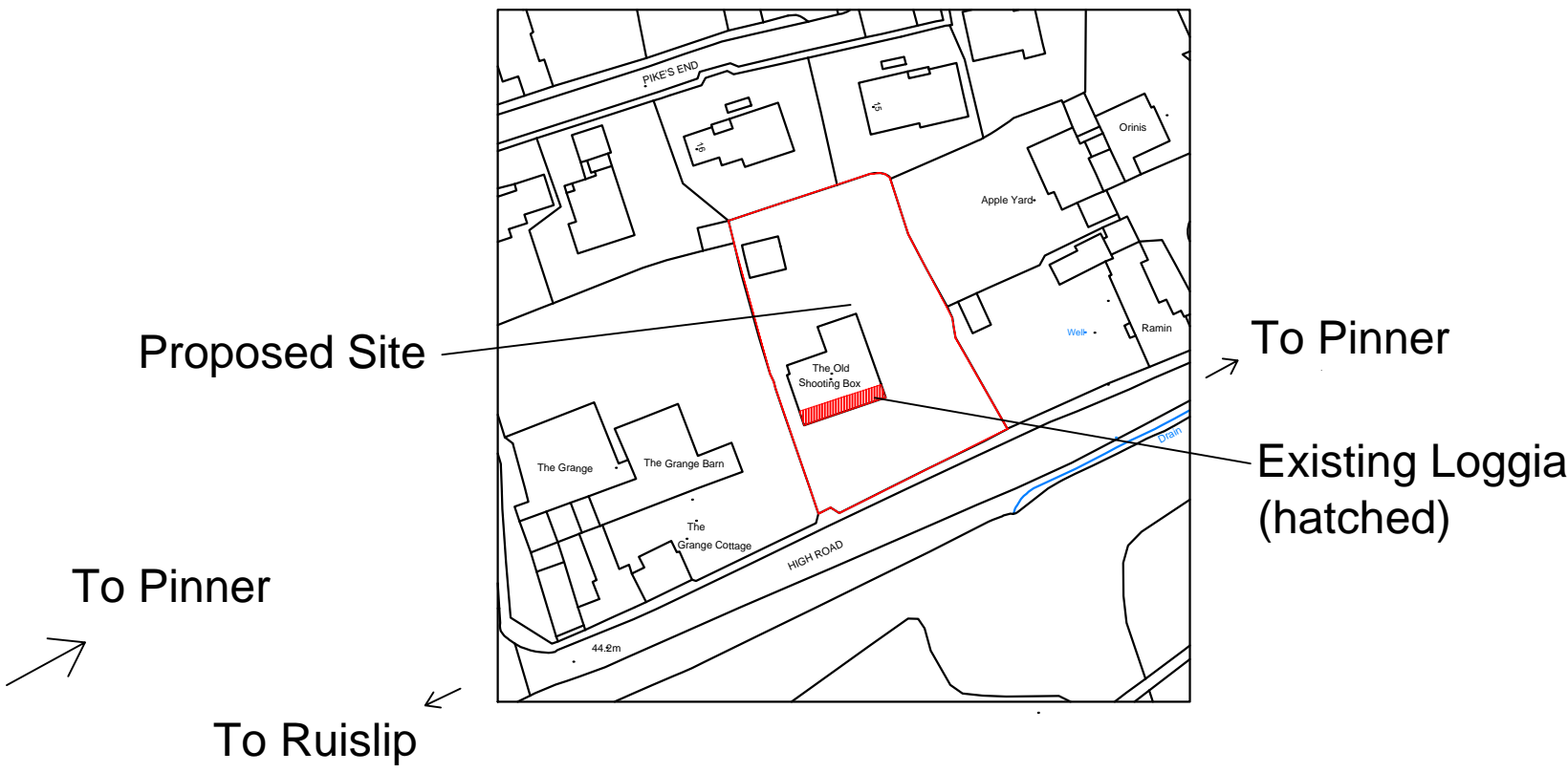
Location Plan Scale 1:1250 @ A1