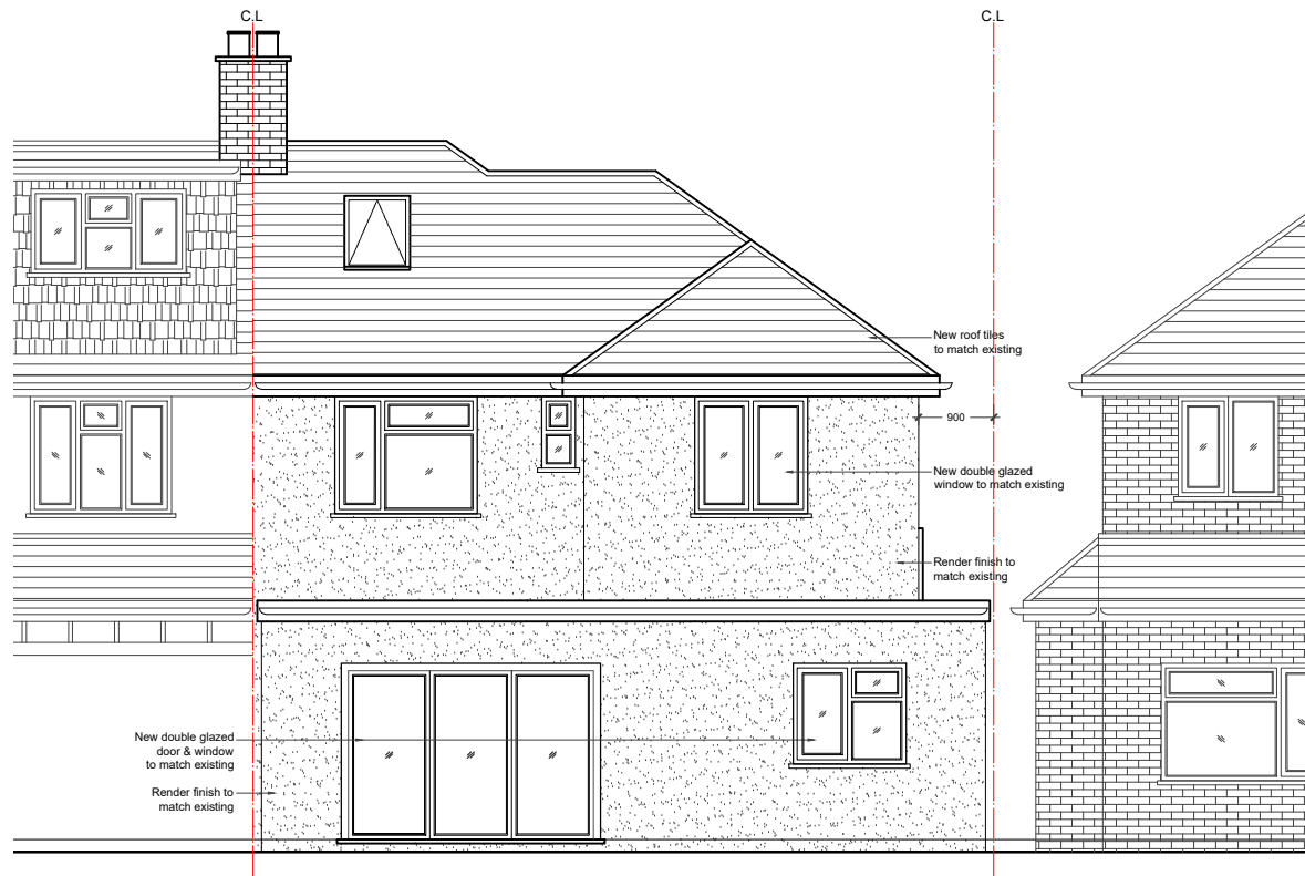
02 - REAR ELEVATION