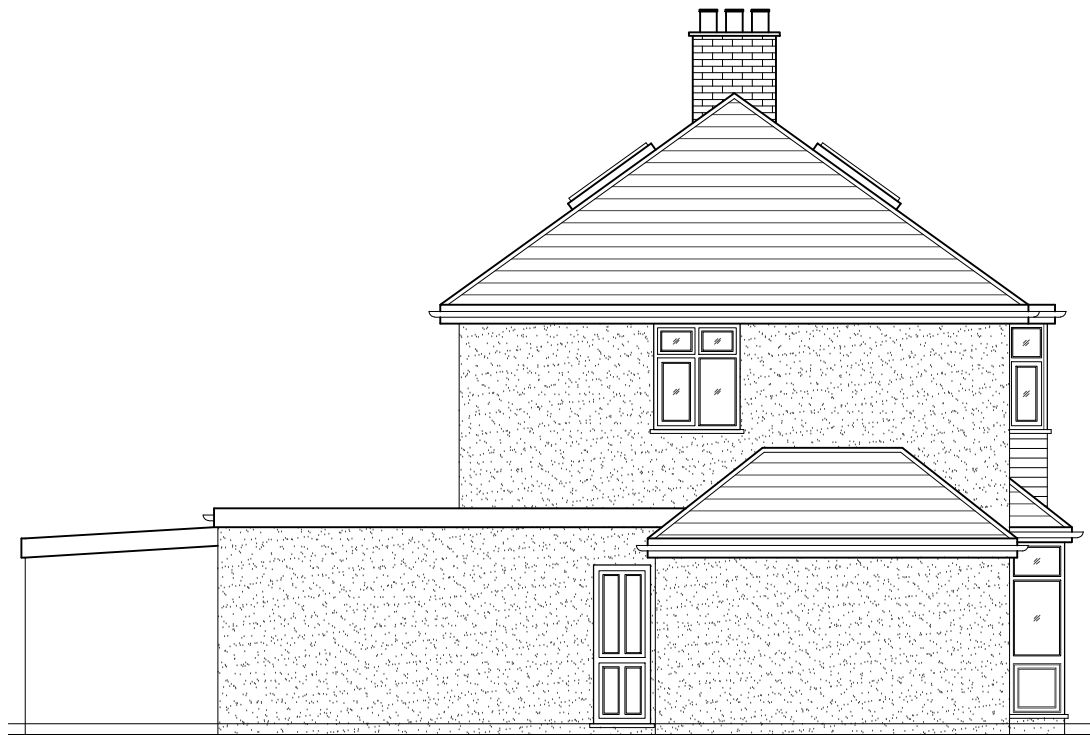
03 - SIDE ELEVATION