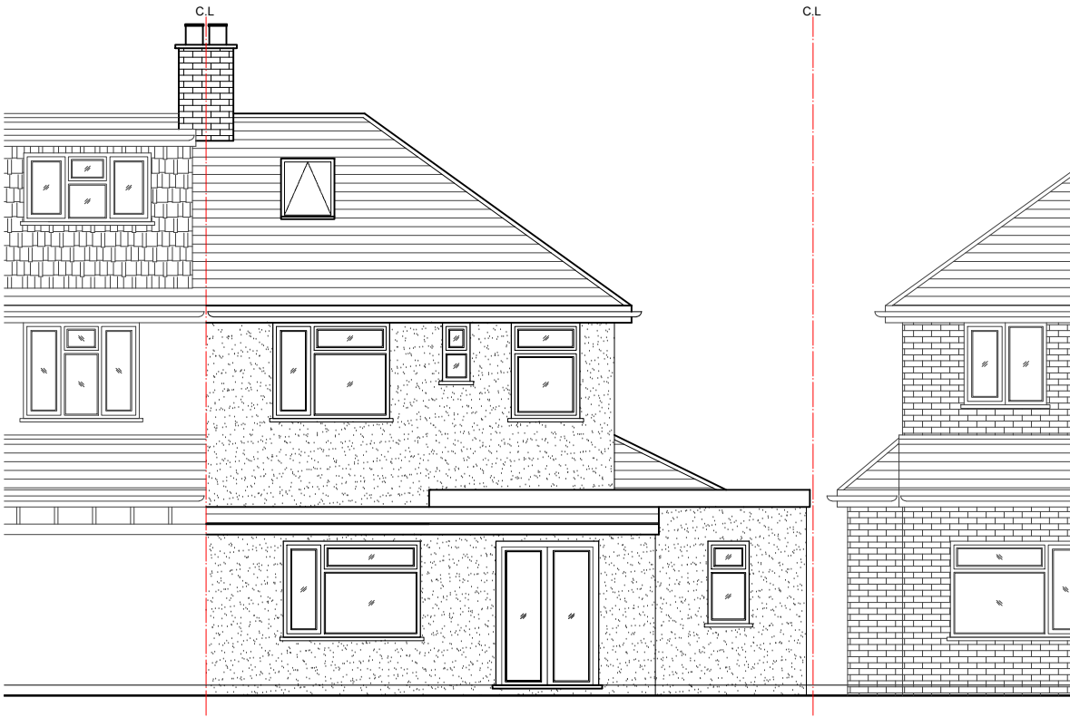
02 - REAR ELEVATION