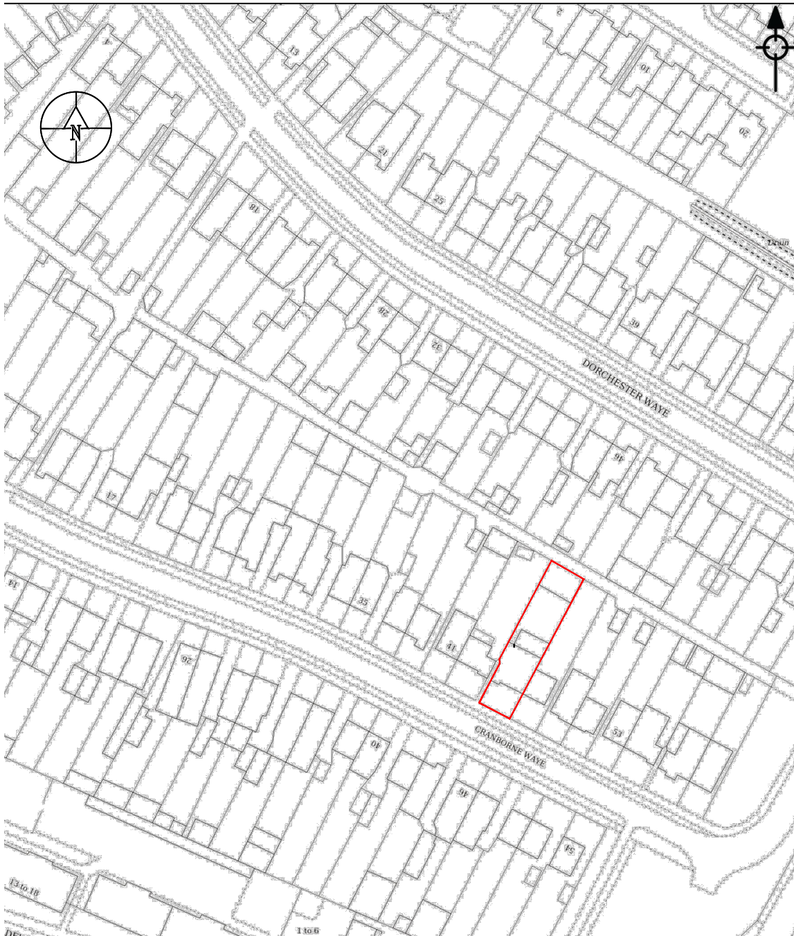
01 - OS MAP SCALE 1:1250