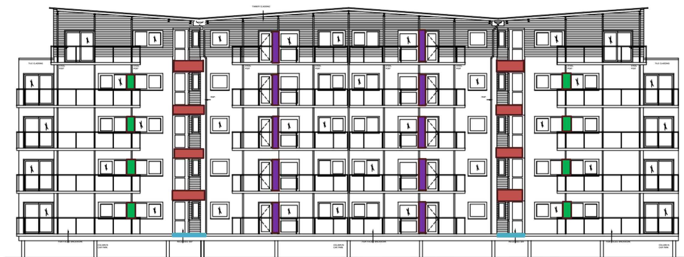
REAR ELEVATION AT 'C'