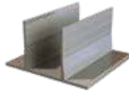
Medium (53mm high)