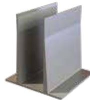
Large (107mm high)