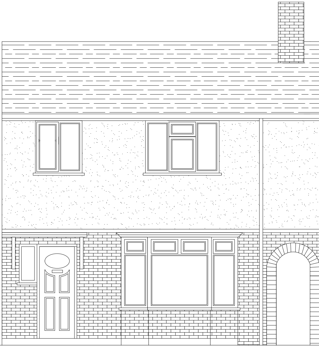
EXISTING FRONT ELEVATION A