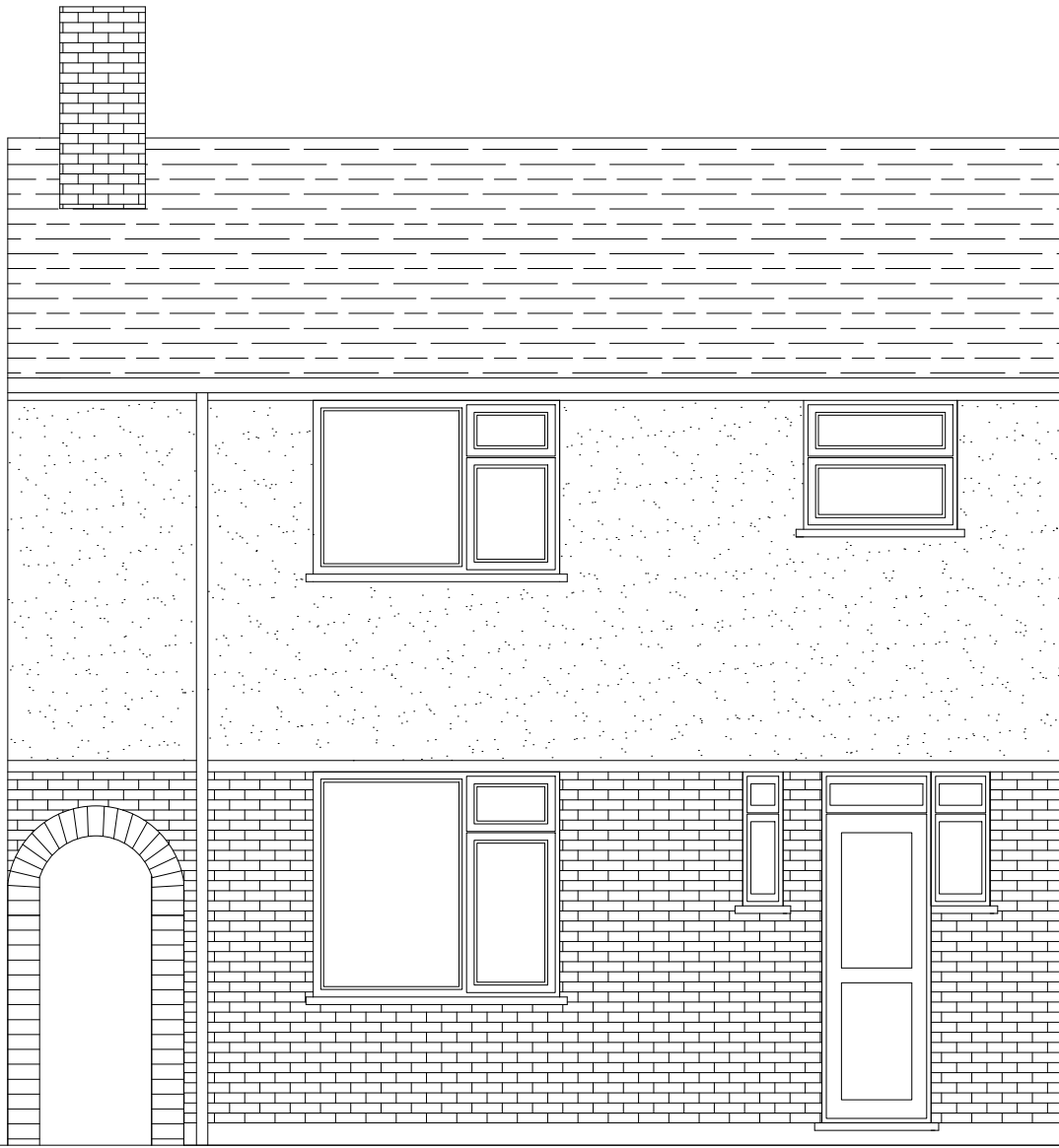
EXISTING REAR ELEVATION C