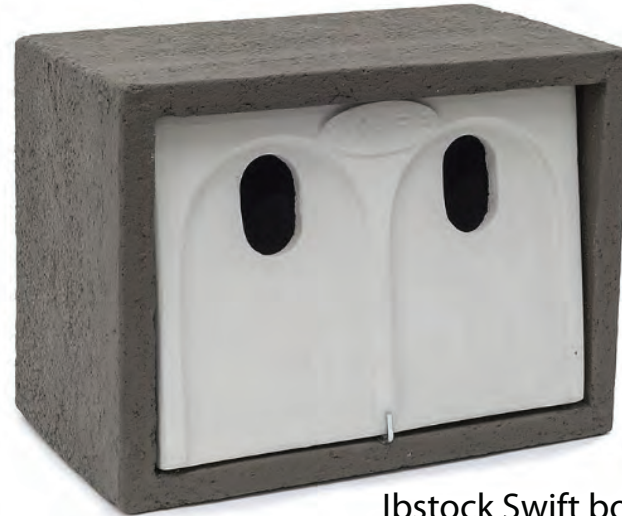
Vivara woodstone sparrow nest box; suitable for both integral fitment or surface mounting

Ibstock Swift boxes are also suitable for house sparrows. Can be customised to suit any exterior finish. Site boxes under eaves, away from windows and direct sunlight.