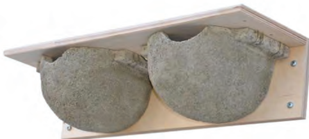
Schwegler model 9b