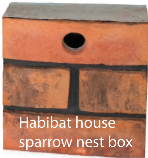
Habibat house sparrow nest box