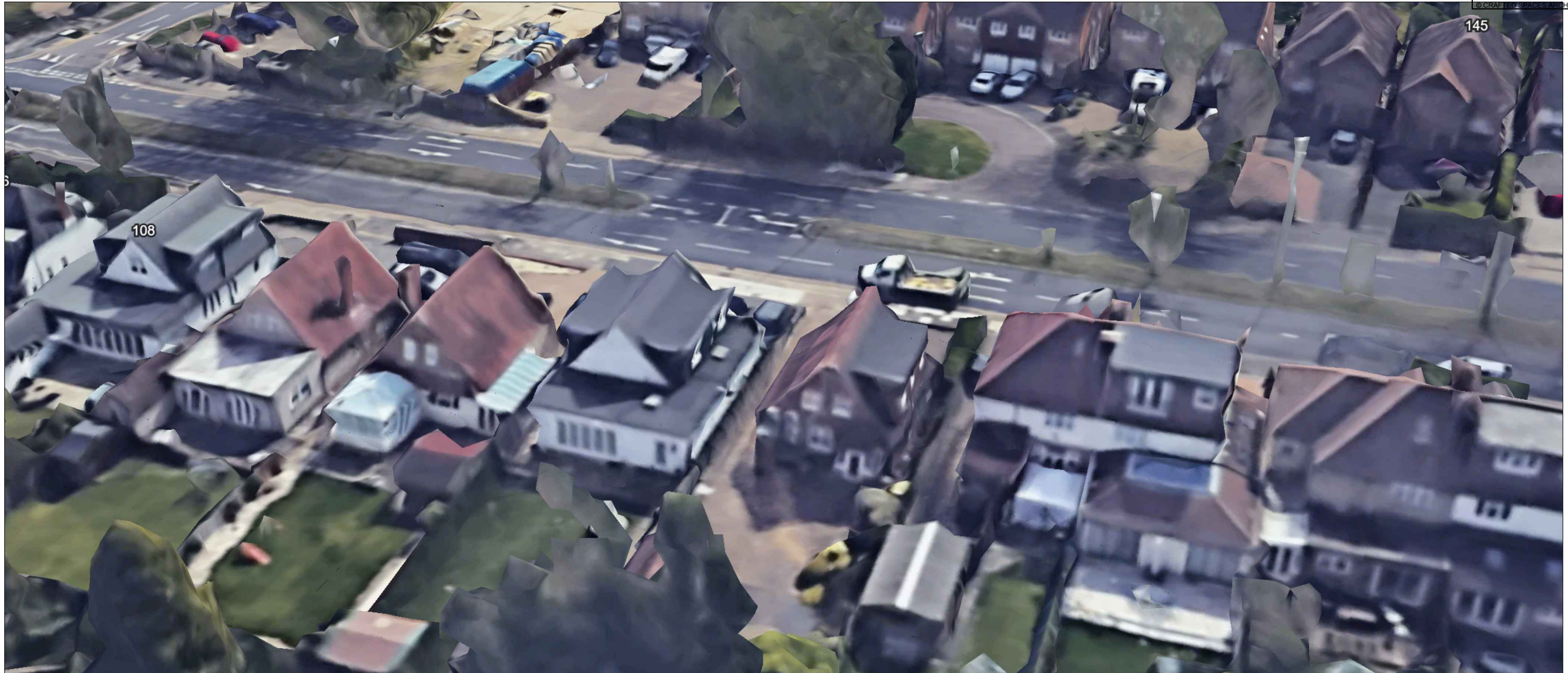
IMAGE SHOWING LARGER SINGLE STORY EXTENSION ALONG SWAKELEYS ROAD.