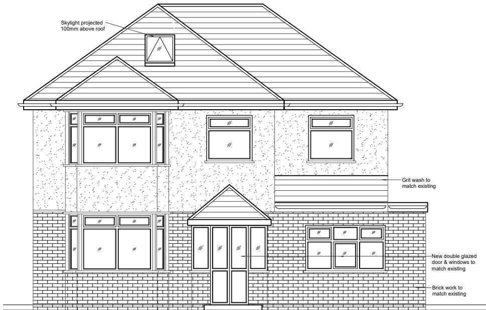
01 - FRONT ELEVATION