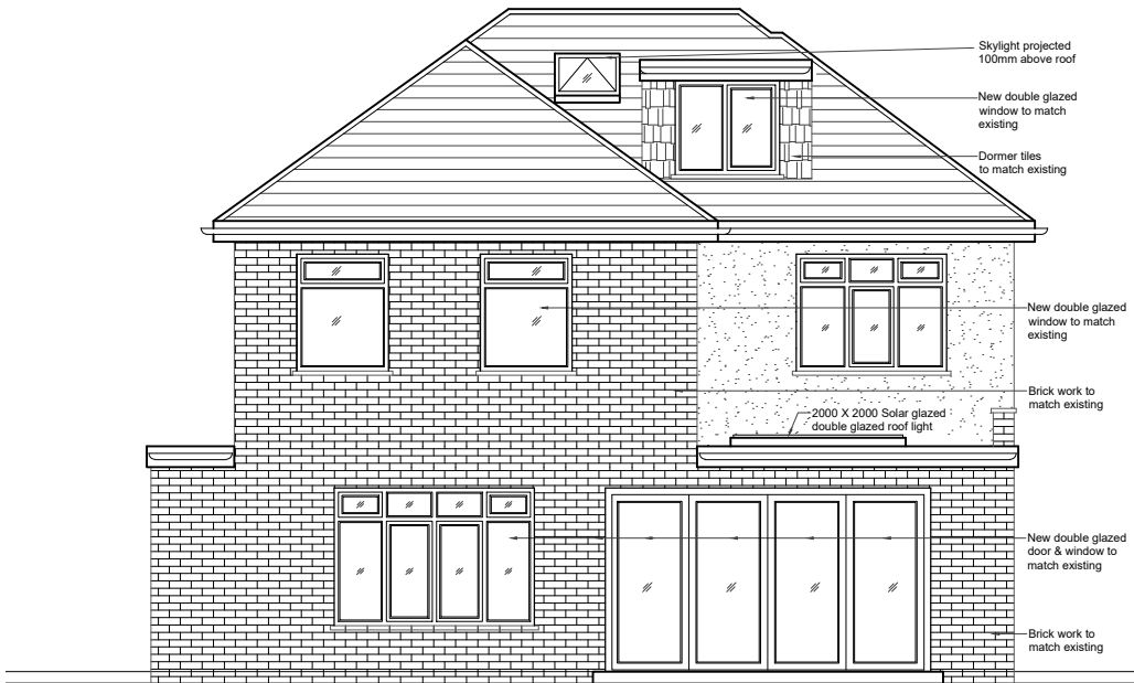
02 - REAR ELEVATION