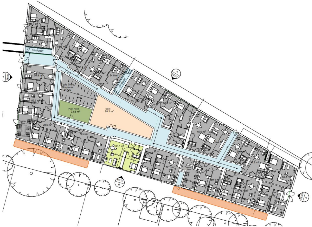
Figure 1: Proposed Site Plan with the vehicle parking areas during construction identified in orange. To confirm, all of the existing private parking spaces along the south-western elevation of Hawthorne Court are in the ownership of Bankway Properties Ltd and are leased to the ground floor unit tenants

contractors can park, as shown in figure 1 below. An unobstructed right of access for the residential units at Rail Lodge shall be ensured at all times.