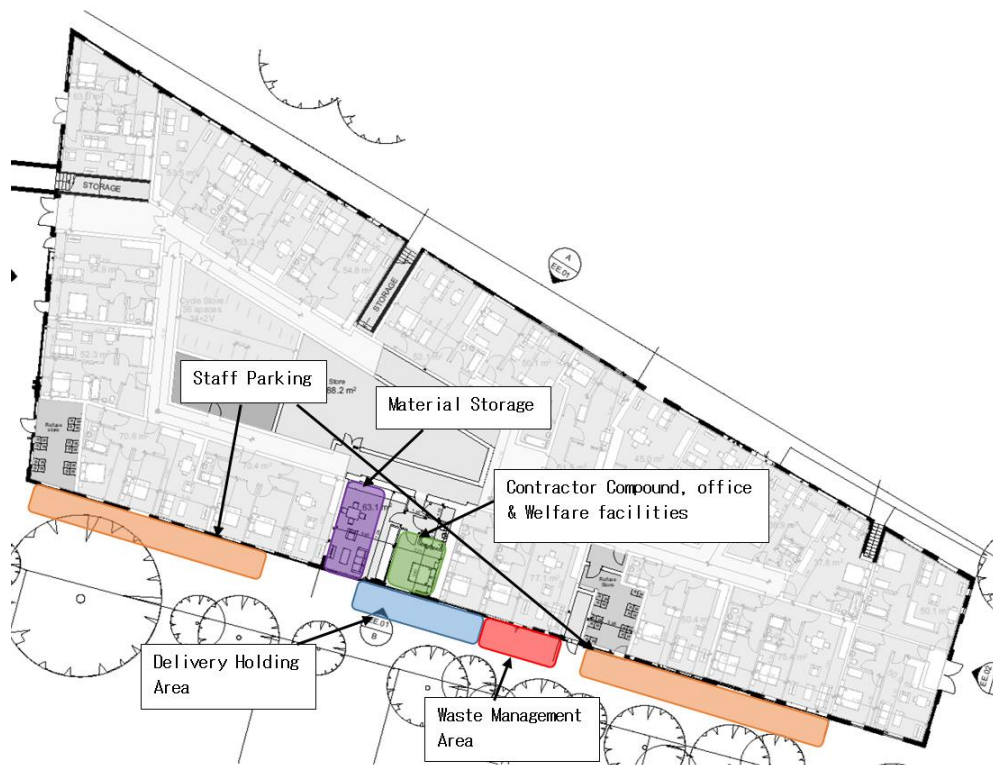
Figure 2: Proposed Site Layout during construction, showing where the staff parking, on-site welfare facilities, material storage and waste management areas will be located

The below site layout at figure 2 shall be adhered to throughout the on-site construction period. Material storage and waste management facilities have been distributed around the site for ease of access during the construction phases.