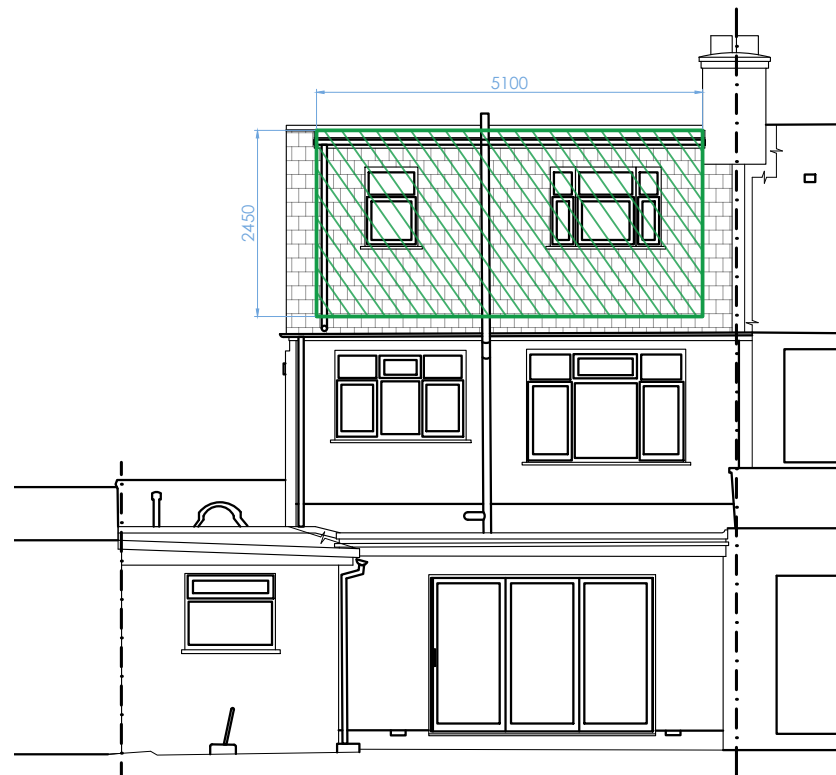
2 PROPOSED REAR ELEVATION SCALE 1:100@A3