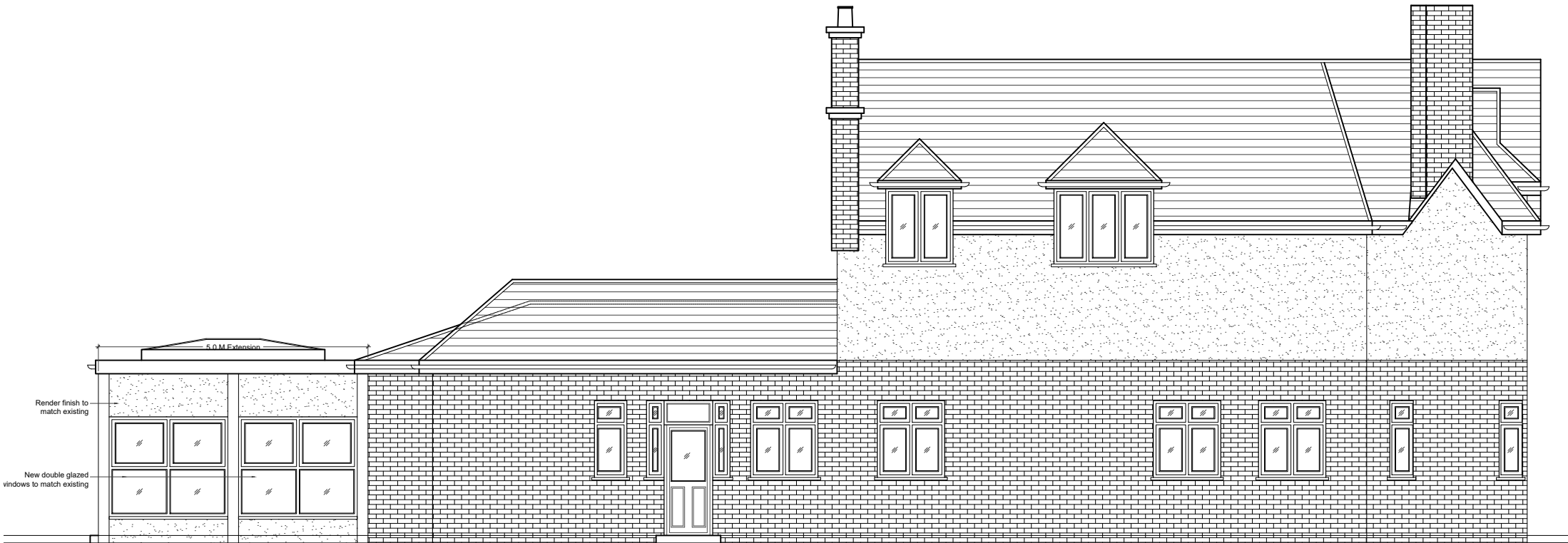
02- LEFT SIDE ELEVATION