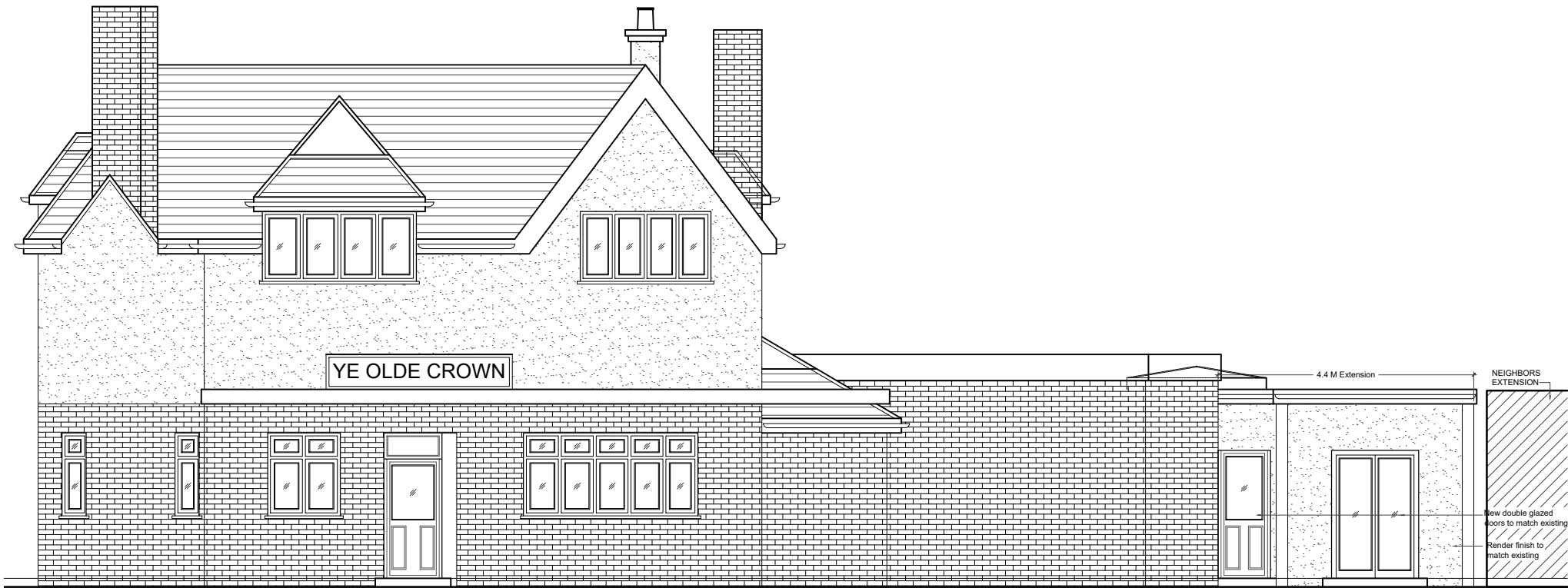
01- FRONT ELEVATION