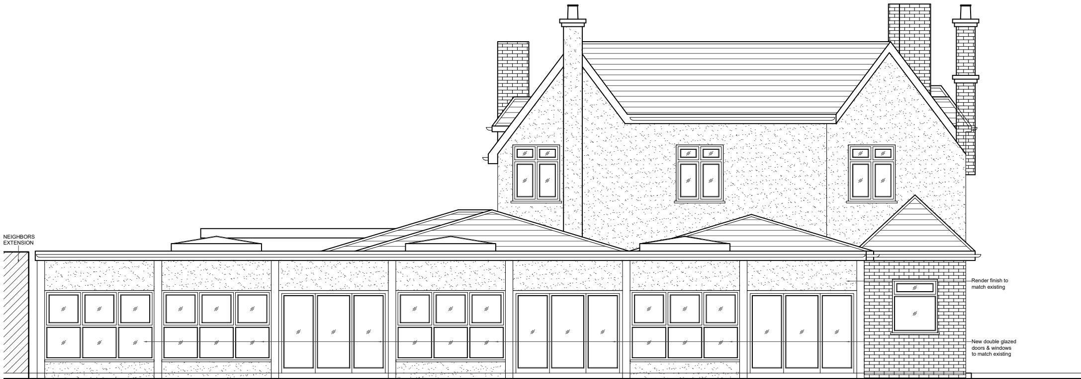
02- REAR ELEVATION