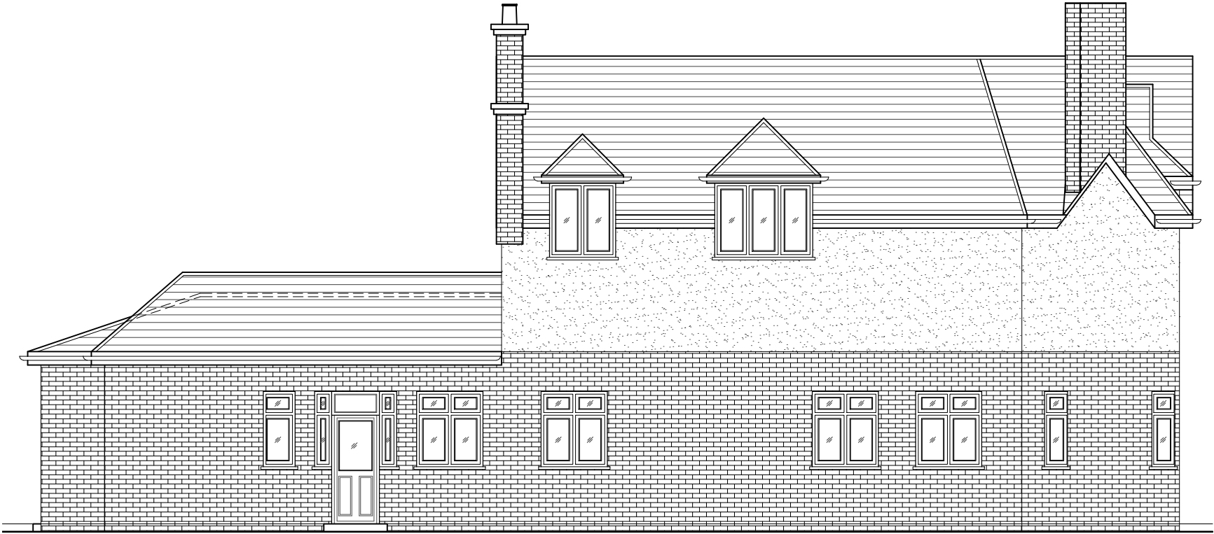
01- LEFT SIDE ELEVATION