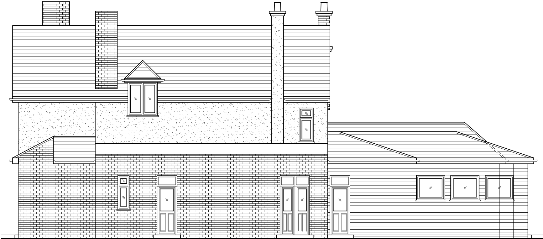
02- RIGHT SIDE ELEVATION